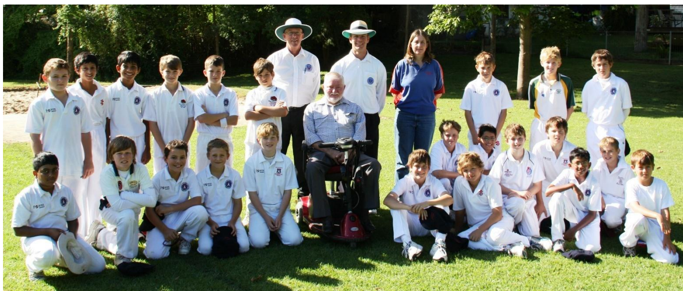
2009-10 GHC teams at Bannockburn Oval, Pymble