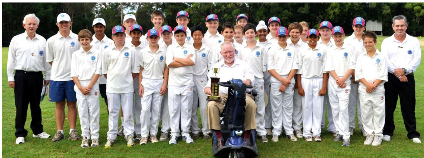
Above – 2011-12 GHC teams at Kenthurst Oval