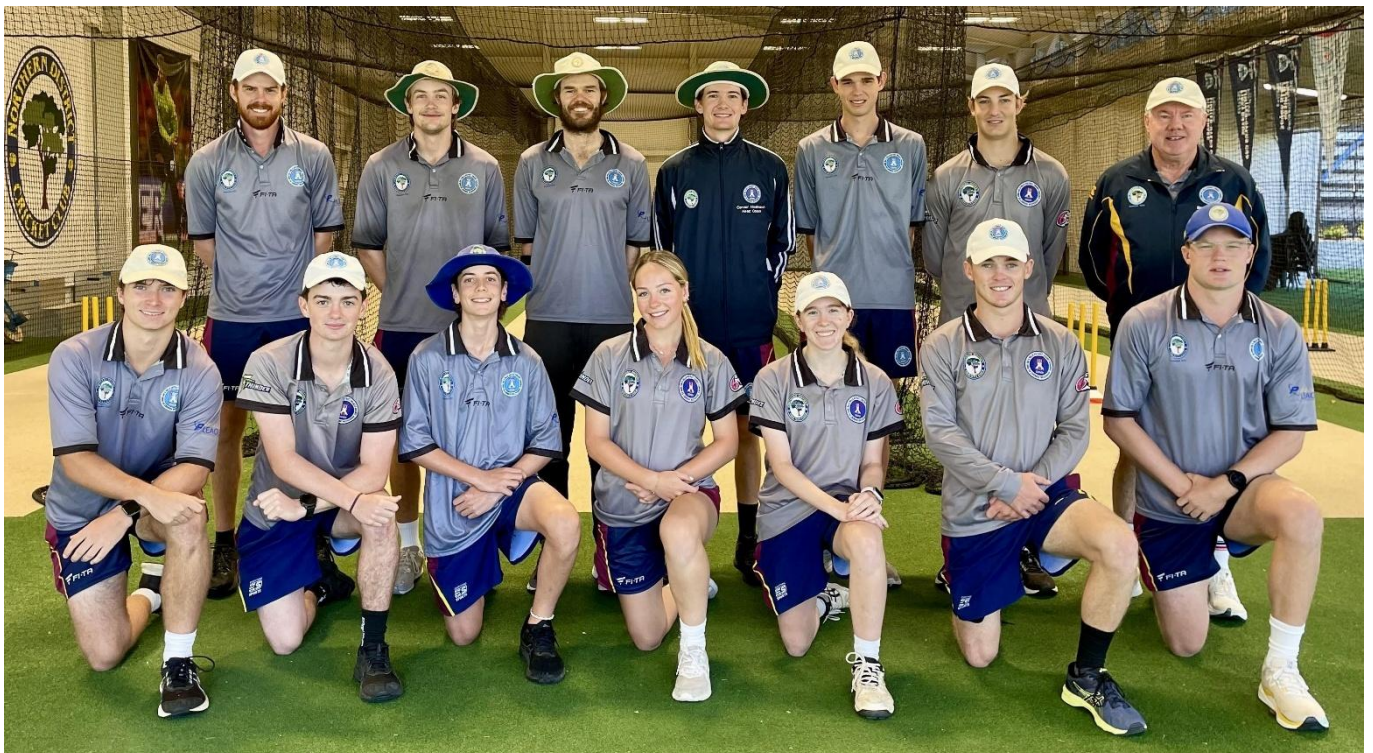
Coaches at our school holiday junior cricket clinic at Mark Taylor Oval, Waitara (20 - 21 January 2025)