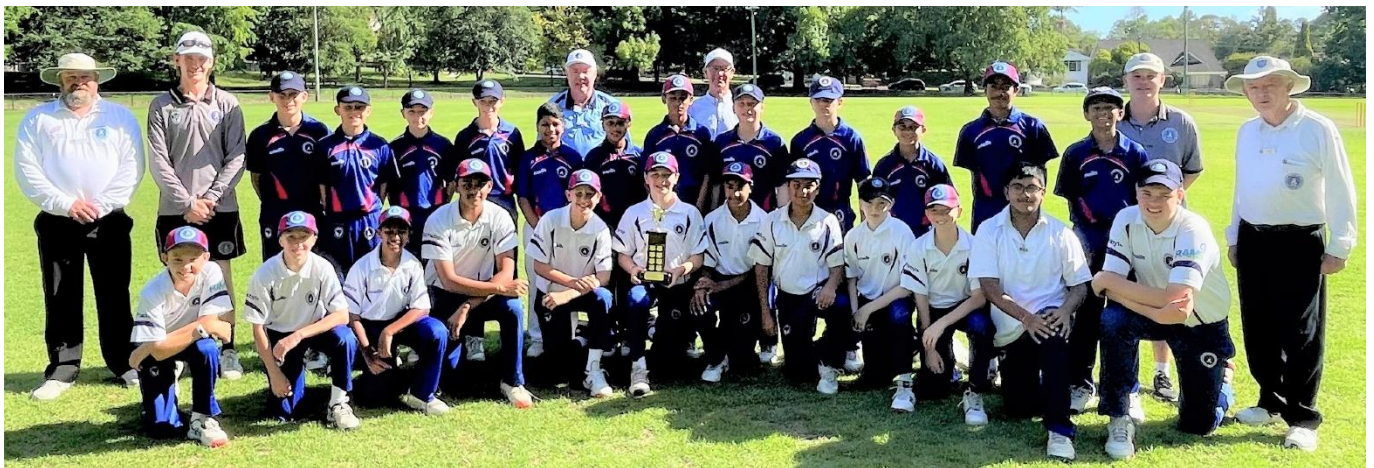
Above – 2022-23 GHC teams at Karuah Park