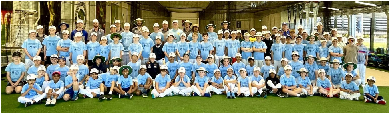
Players & coaches at our school holiday junior cricket clinic at Mark Taylor Oval, Waitara (20-21 January 2025)