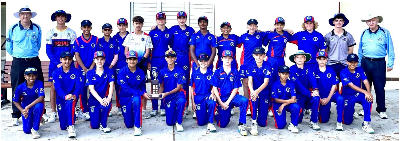
Below – 2023-24 GHC teams at Karuah Park