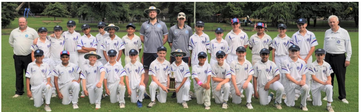
Below – 2020-21 GHC teams at Karuah Park