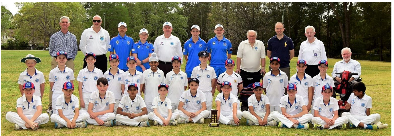
Above – 2017-18 GHC teams at Karuah Park