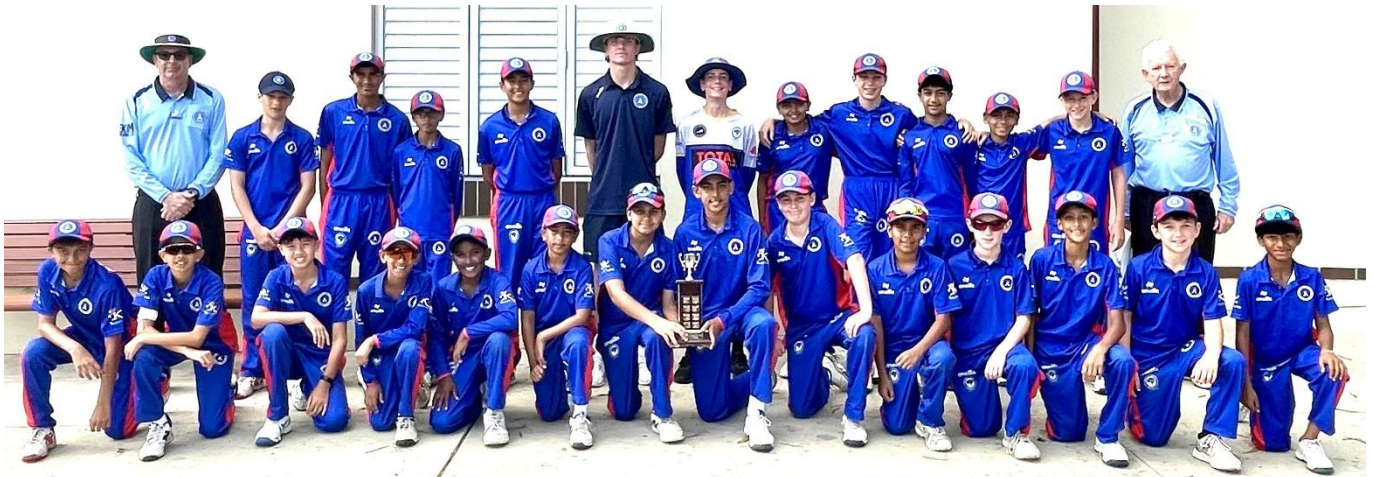
Above – 2024-25 GHC teams at Karuah Park