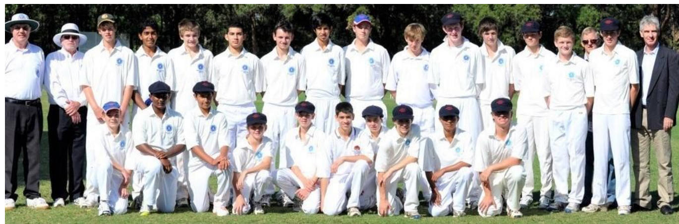
Above 2010-11 match at Kenthurst Oval