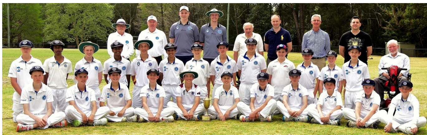
Below 2017-18 match at Turramurra Oval