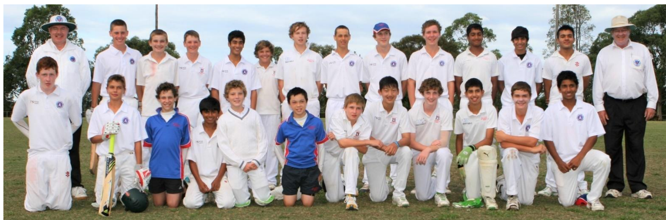
Below 2009-10 match at Parklands Oval