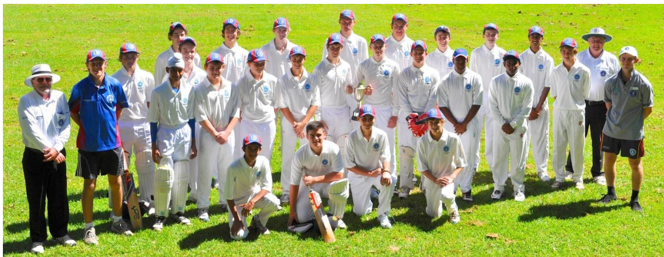
Above 2012-13 match at Turramurra Oval