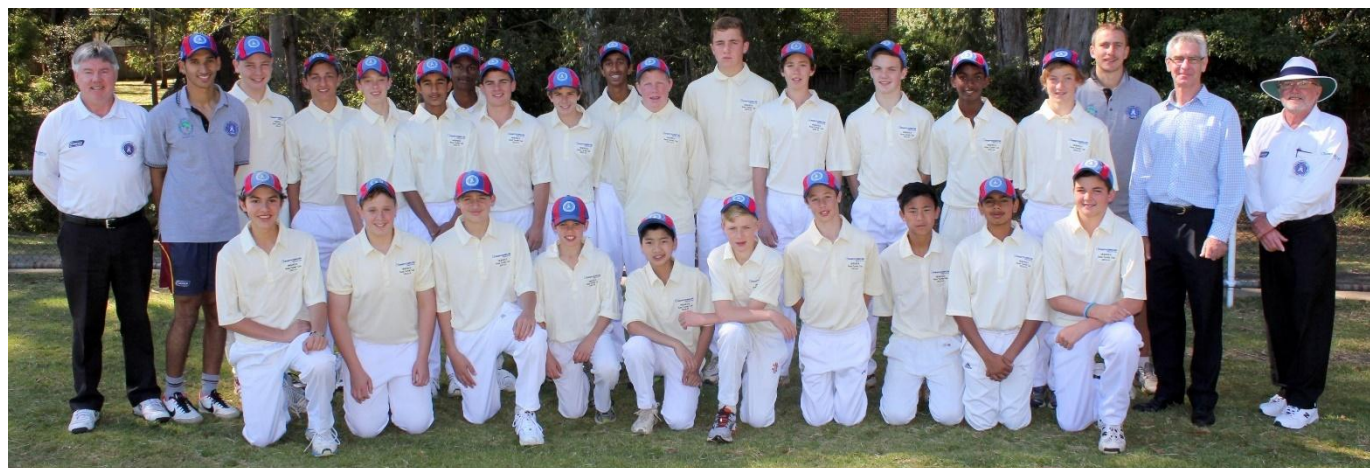
Below 2013-14 match at Turrumurra Oval