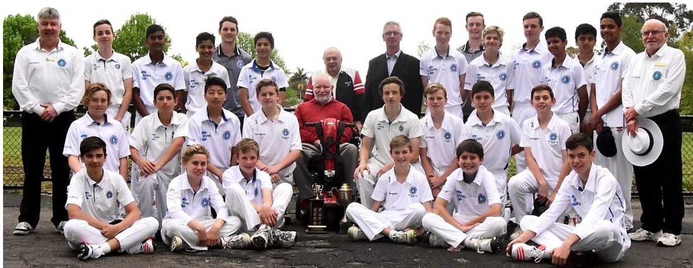
Above 2016-17 match at Turrumurra Oval