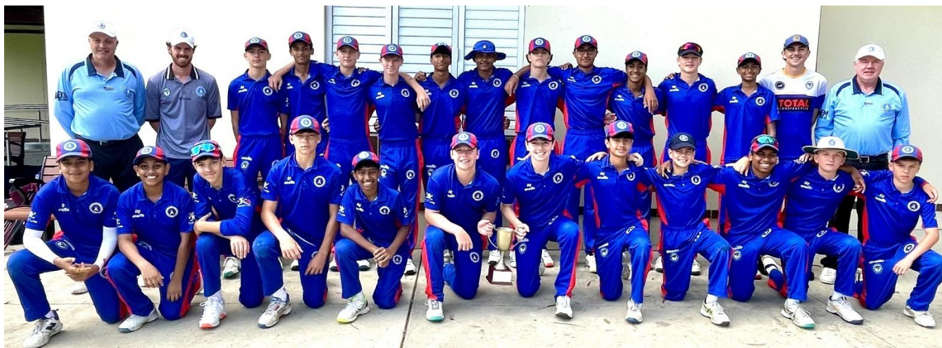
Above 2024-25 match at Turramurra Oval