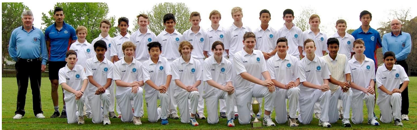
Above 2014-15 match at Turrumurra Oval