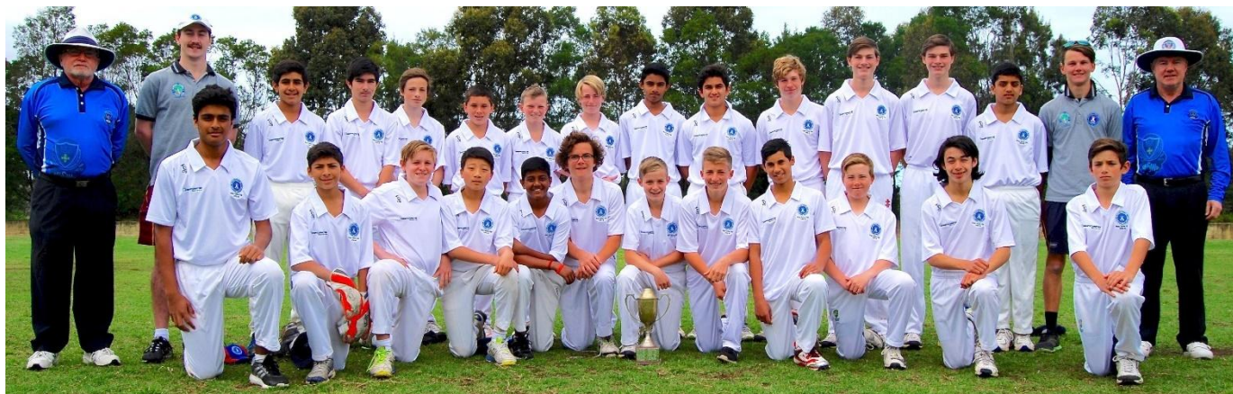
Below 2015-16 match at Headen Park, Thornleigh