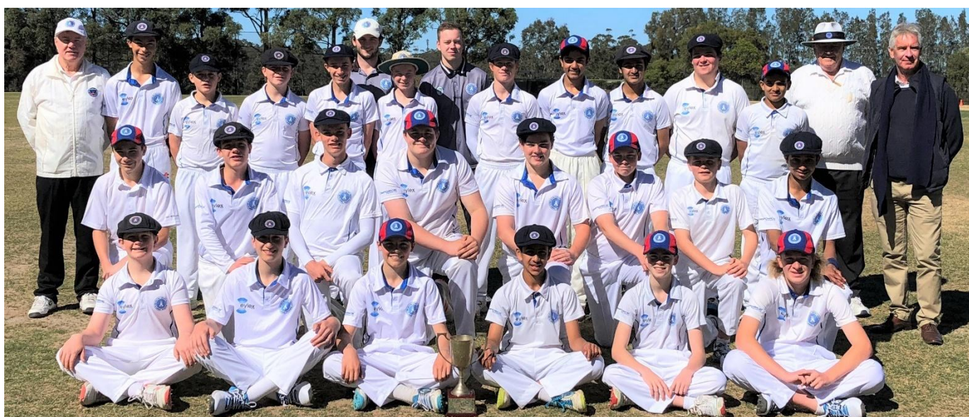
Above 2018-19 match at Rosewood Oval, Barker College