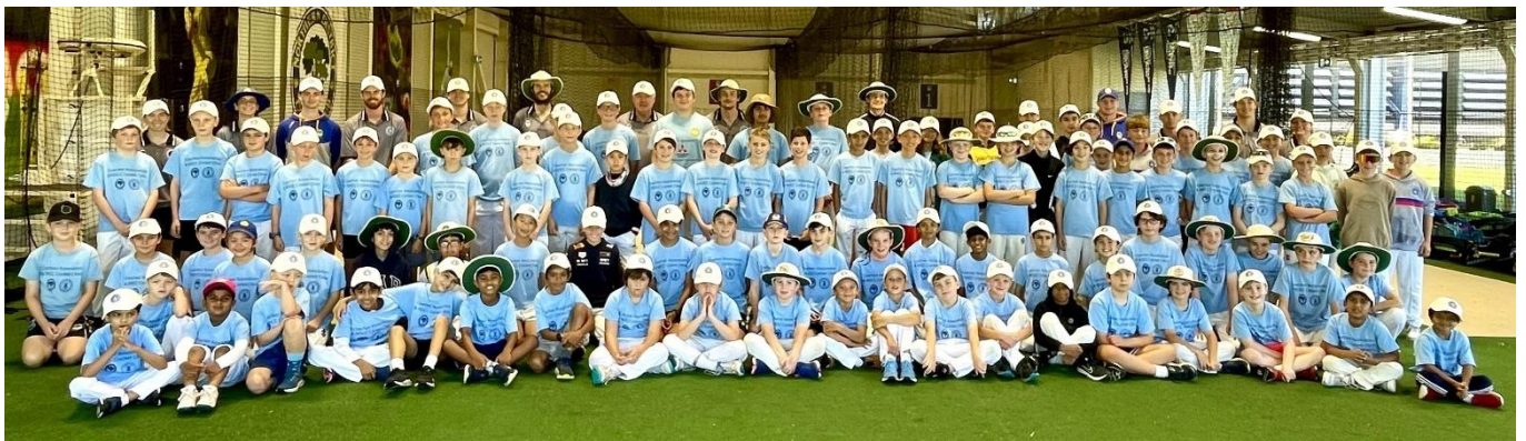
Players & coaches at our school holiday junior cricket clinic at Mark Taylor Oval, Waitara (20-21 January 2025)