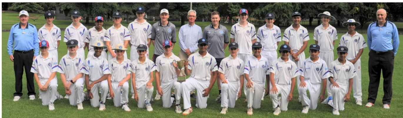
Above 2020-21 match at Turramurra Oval