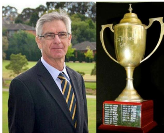
The Ross Turner Cup