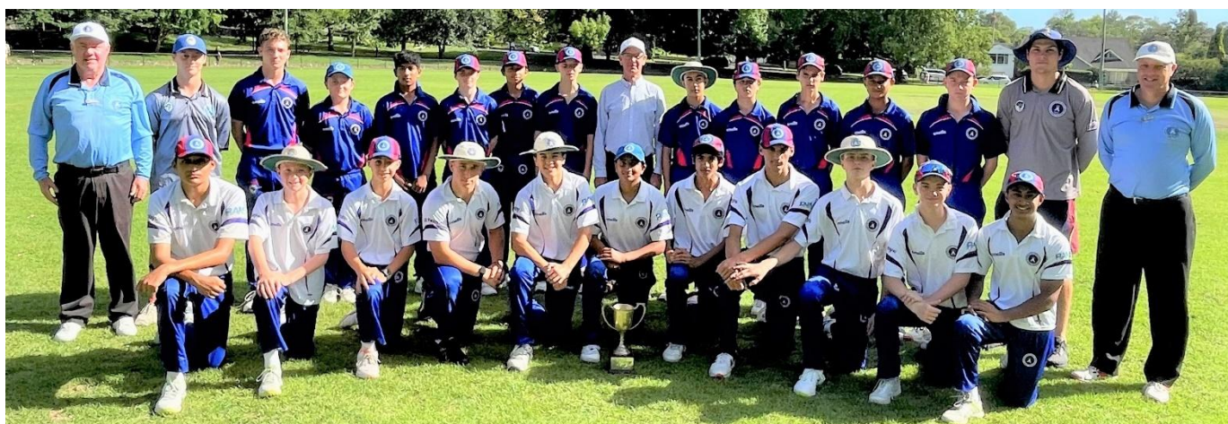
Below 2022-23 match at Turramurra Oval