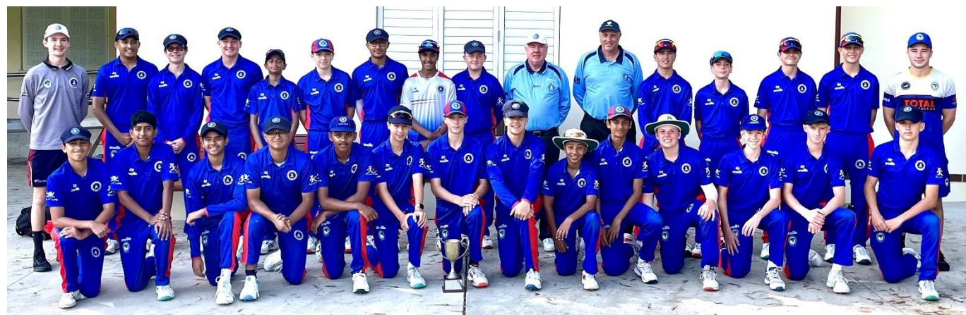
Above 2023-24 match at Turramurra Oval