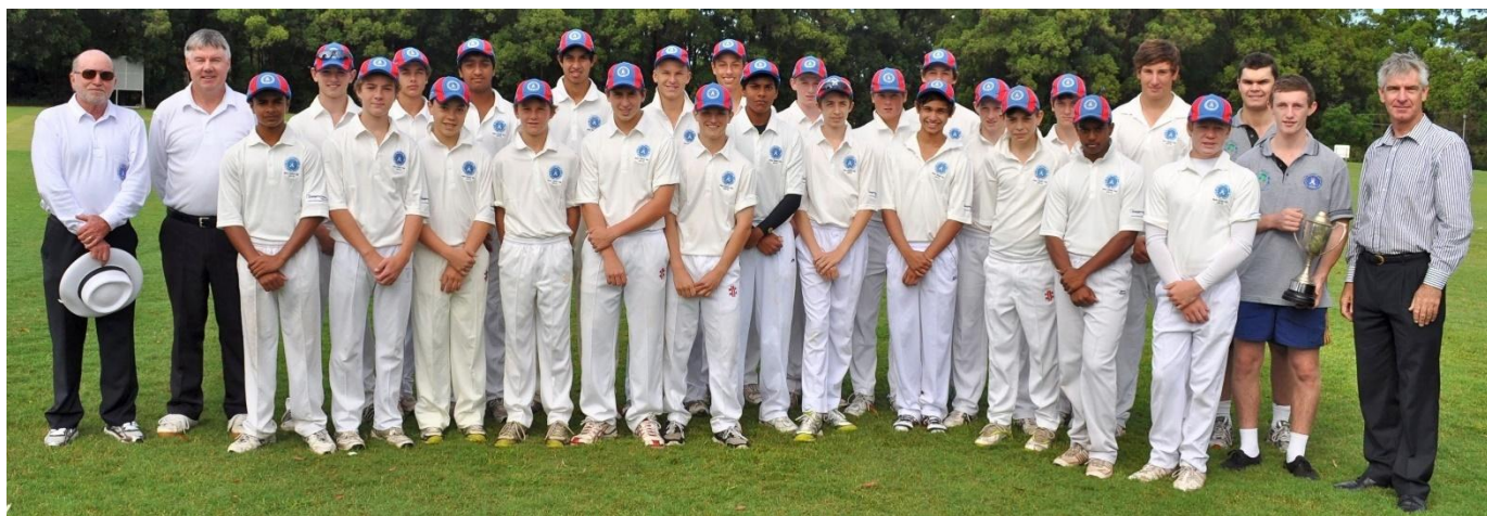
Below 2011-12 match at Kenthurst Oval