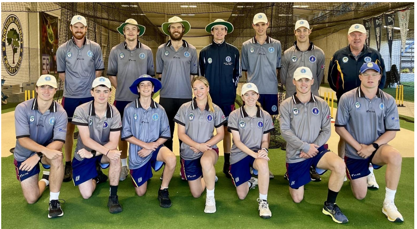
Coaches at our school holiday junior cricket clinic at Mark Taylor Oval, Waitara (20 - 21 January 2025)