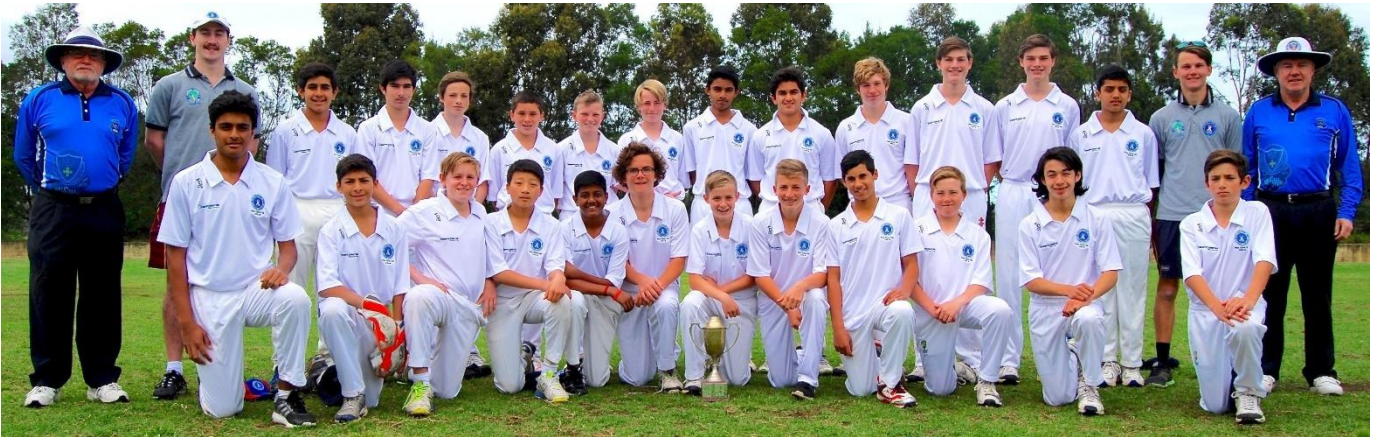
Below 2015-16 match at Headen Park, Thornleigh