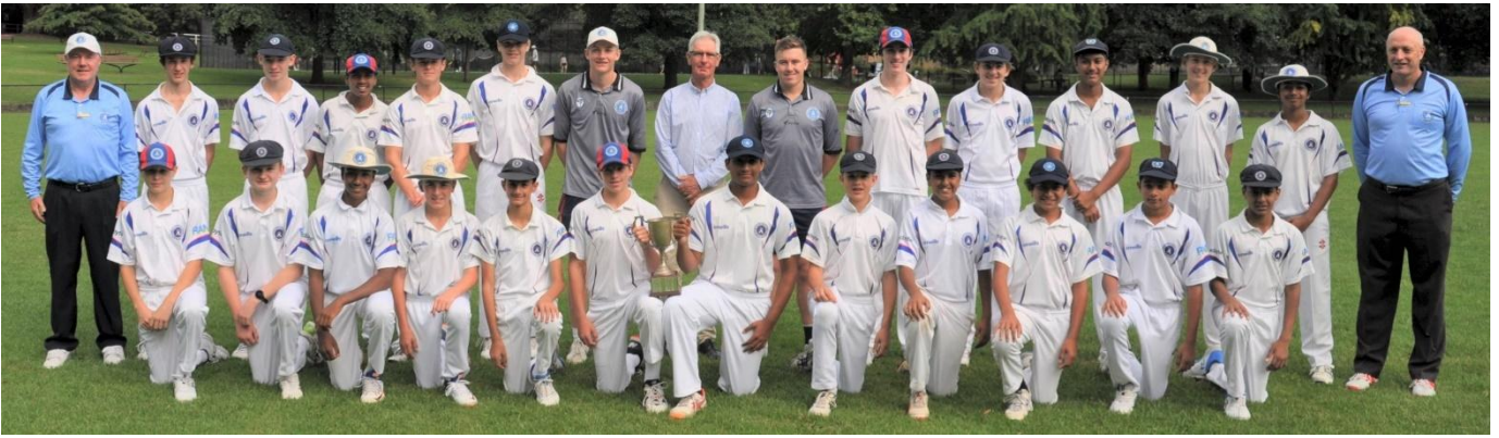
Above 2020-21 match at Turramurra Oval