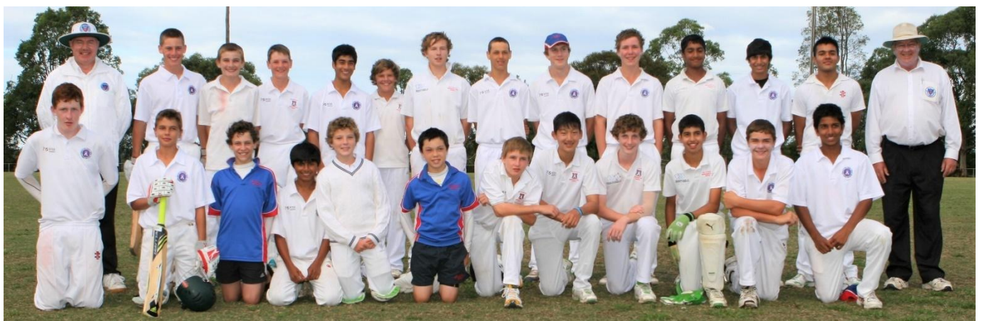
Below 2009-10 match at Parklands Oval