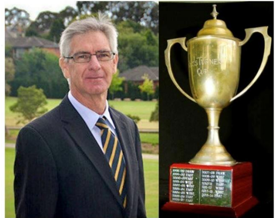
The Ross Turner Cup