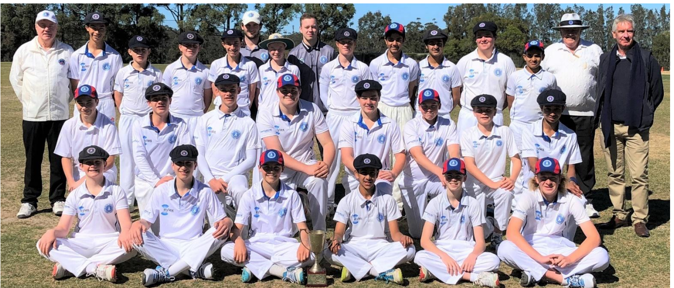
Above 2018-19 match at Rosewood Oval, Barker College