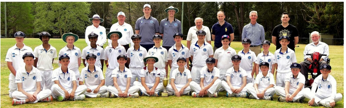
Below 2017-18 match at Turramurra Oval