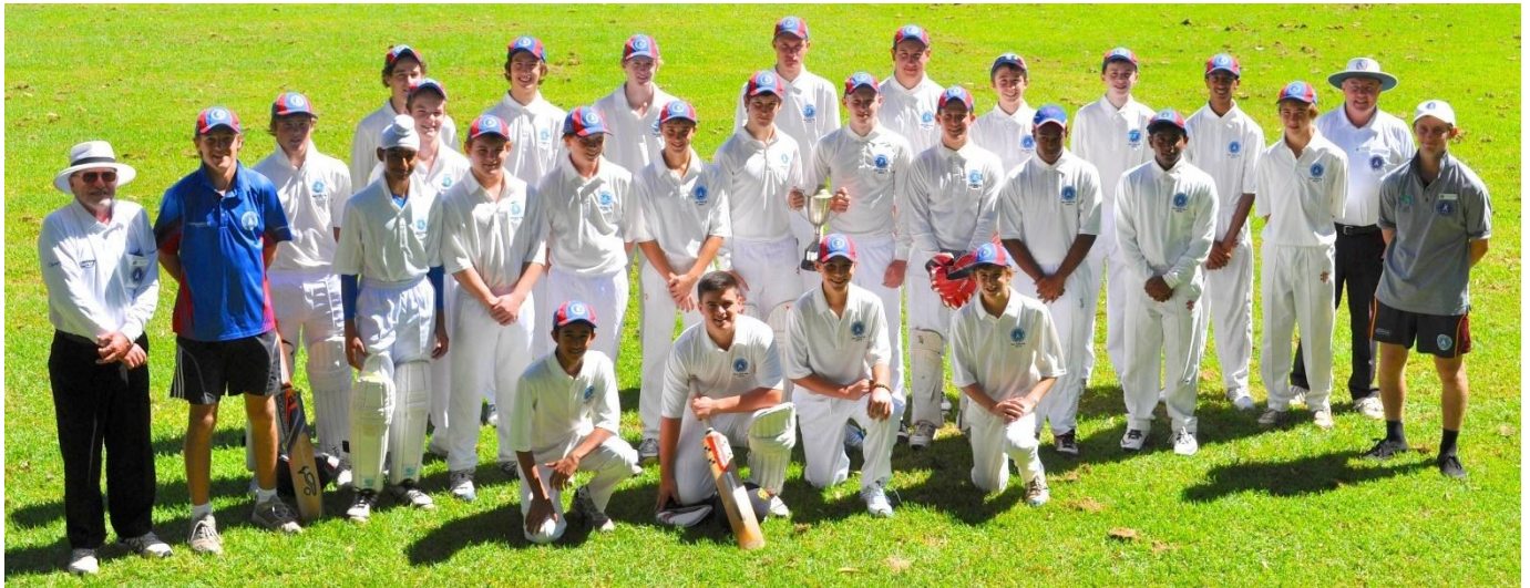
Above 2012-13 match at Turrumurra Oval