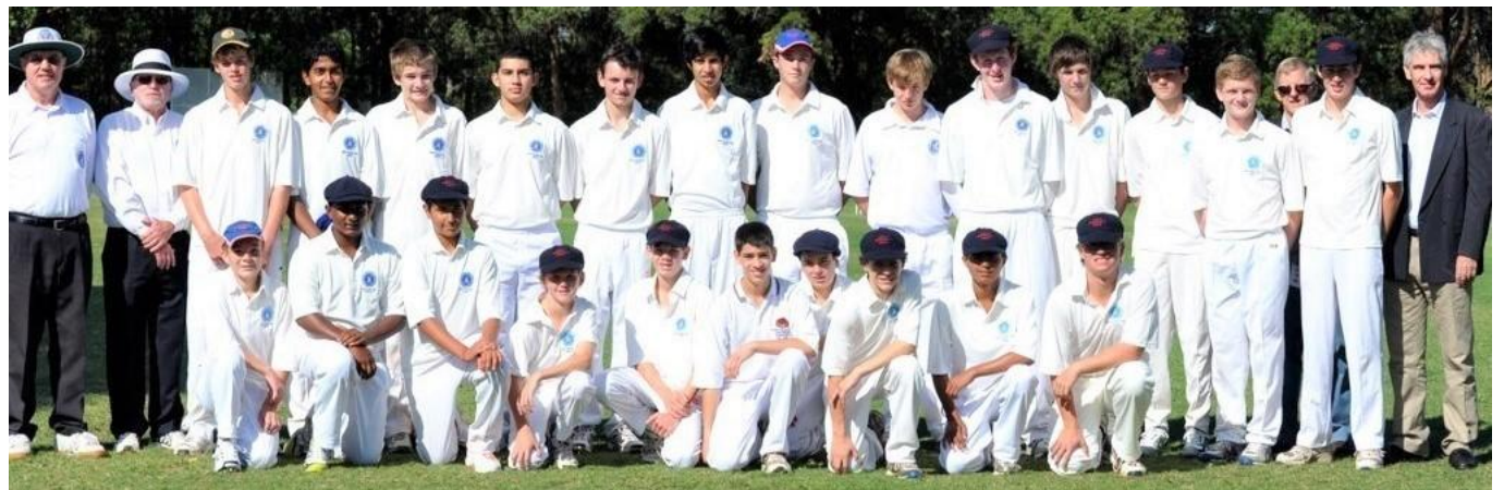
Above 2010-11 match at Kenthurst Oval