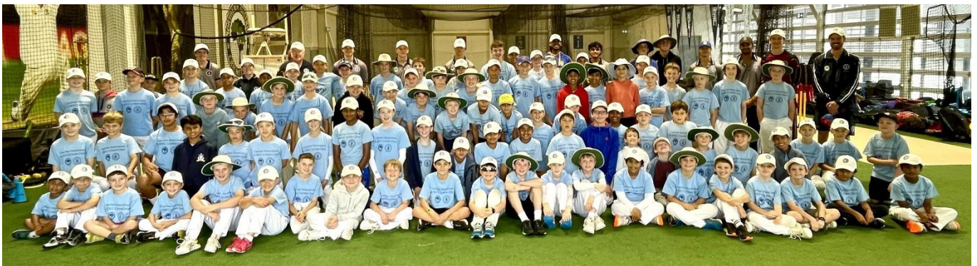
Players & coaches at our school holiday junior cricket clinic at Mark Taylor Oval, Waitara (19-20 January 2026)