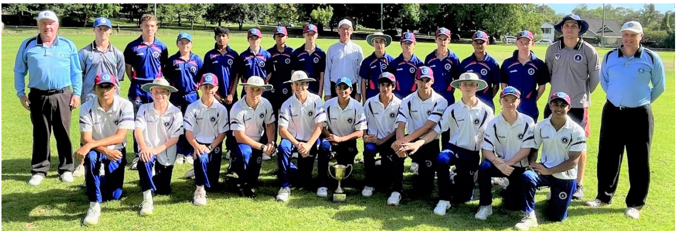
Below 2022-23 match at Turramurra Oval