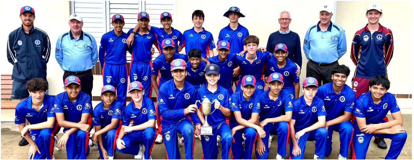
Above 2025-26 match at Turramurra Oval