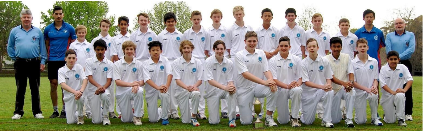
Above 2014-15 match at Turrumurra Oval