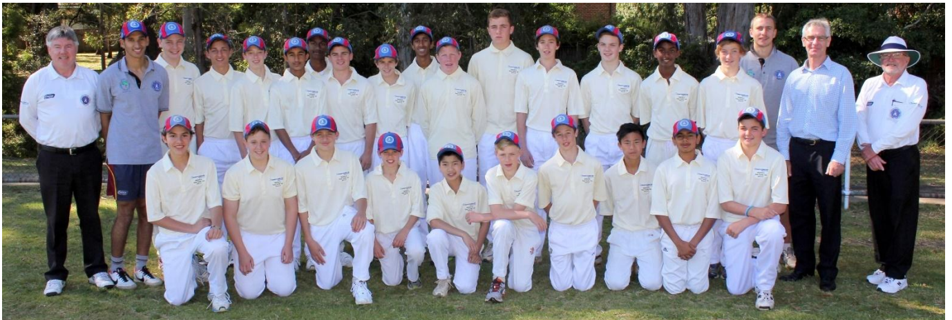
Below 2013-14 match at Turrumurra Oval