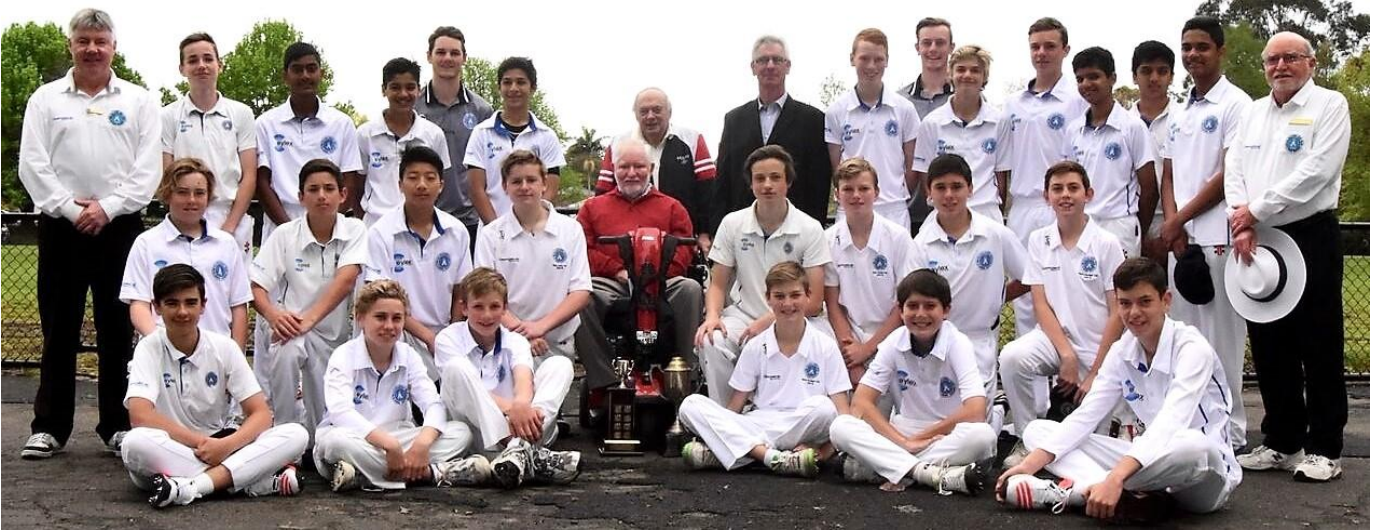
Above 2016-17 match at Turrumurra Oval