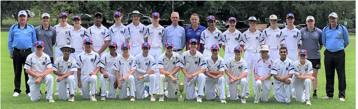
Below 2019-20 match at Turramurra Oval