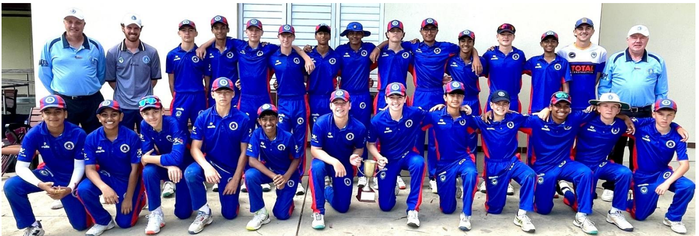
Below 2024-25 match at Turramurra Oval