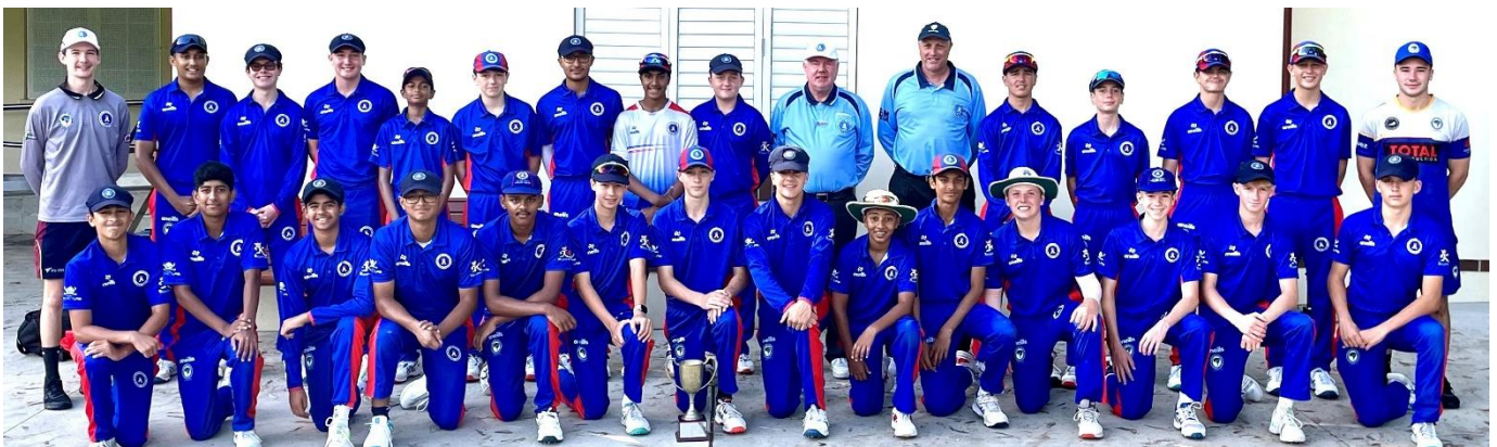
Above 2023-24 match at Turramurra Oval