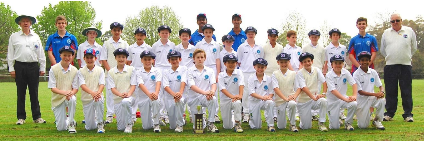
2014-15 GHC teams at Karuah Park, Turrumurra