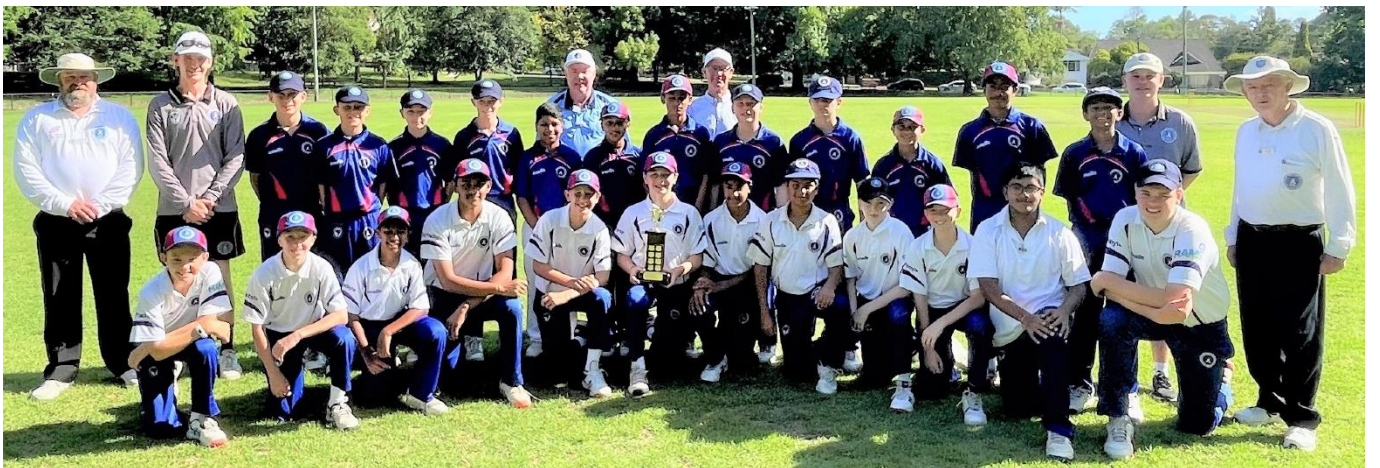
Above – 2022-23 GHC teams at Karuah Park