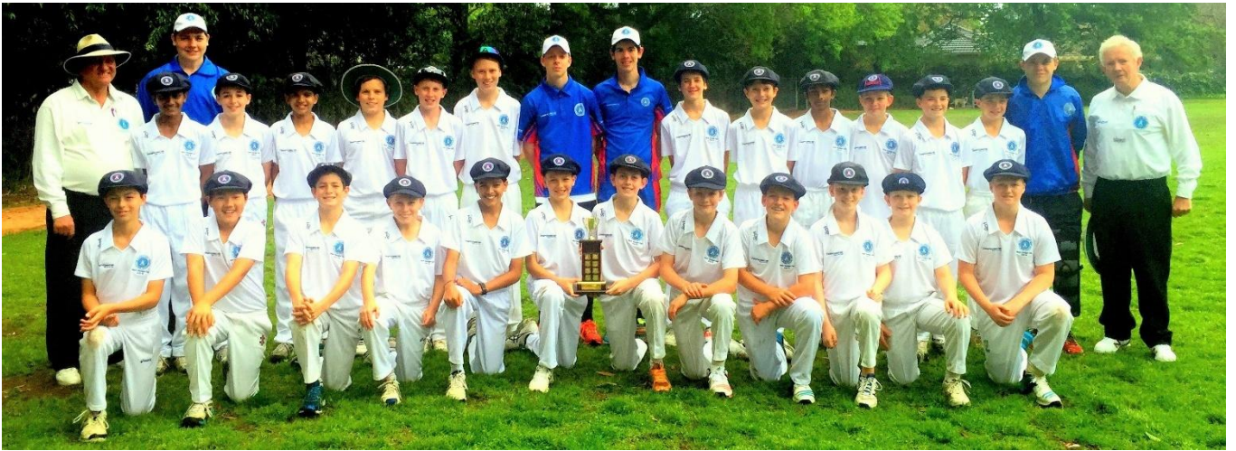
2015-16 GHC teams at Karuah Park, Turrumurra