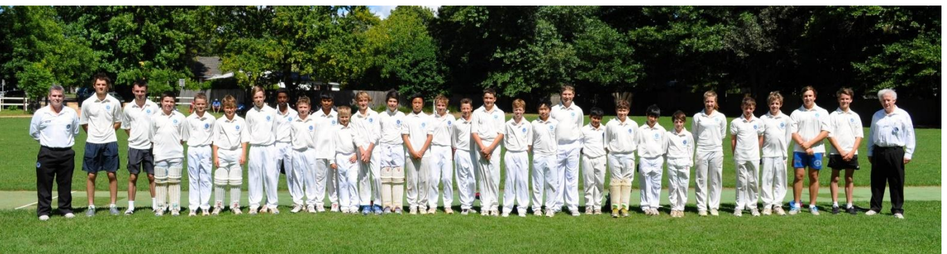
2012-13 GHC teams at Karuah Park, Turrumurra