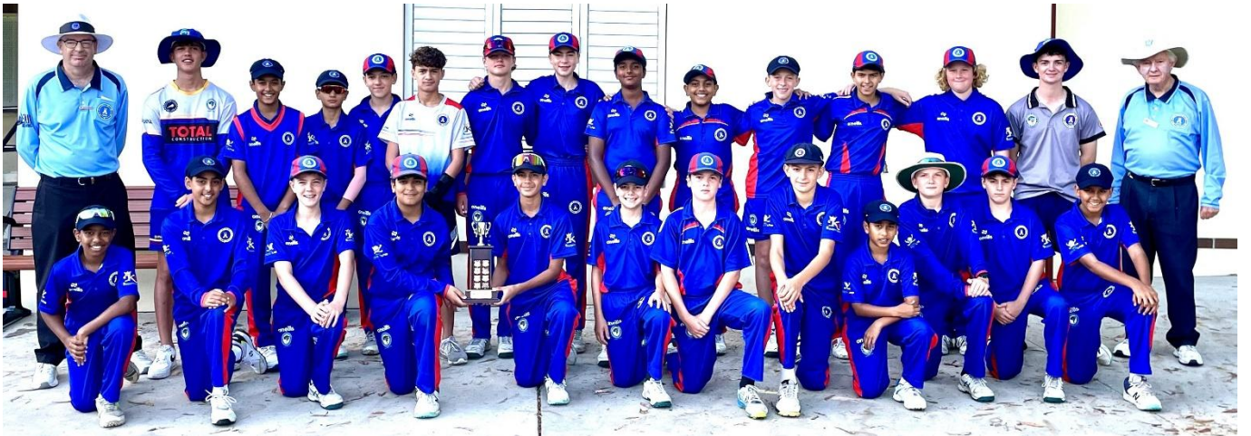
Below – 2023-24 GHC teams at Karuah Park