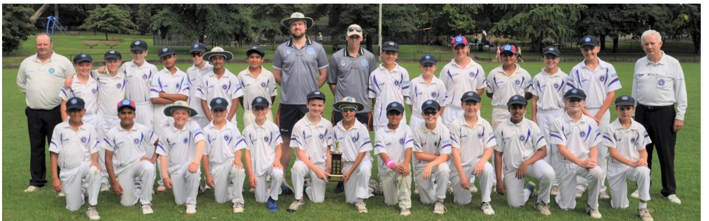
Below – 2020-21 GHC teams at Karuah Park