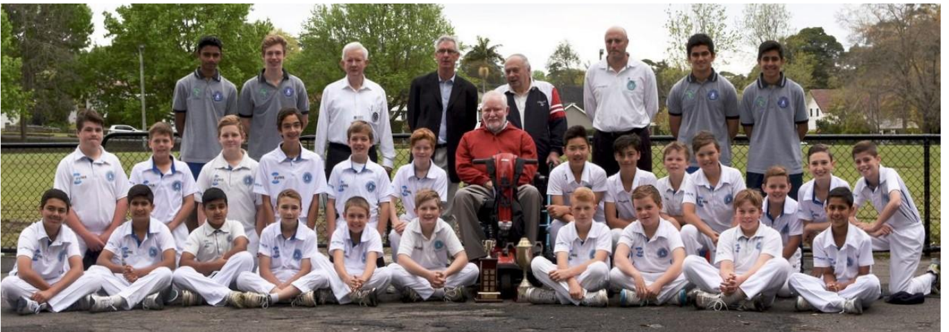
GHC teams at Karuah Park