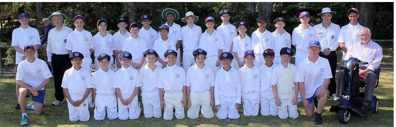
2013-14 GHC teams at Karuah Park, Turrumurra