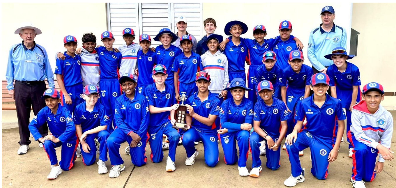
2025-26 GHC teams at Karuah Park