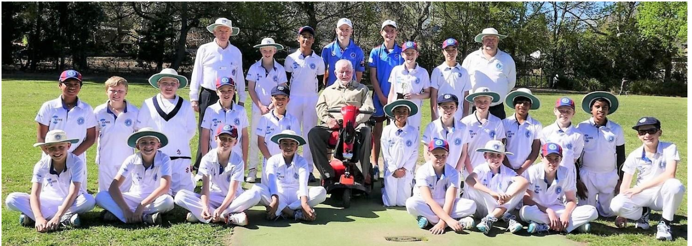
GHC teams at Karuah Park