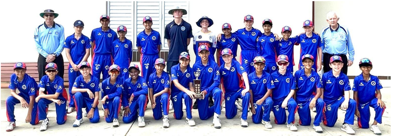
Above – 2024-25 GHC teams at Karuah Park