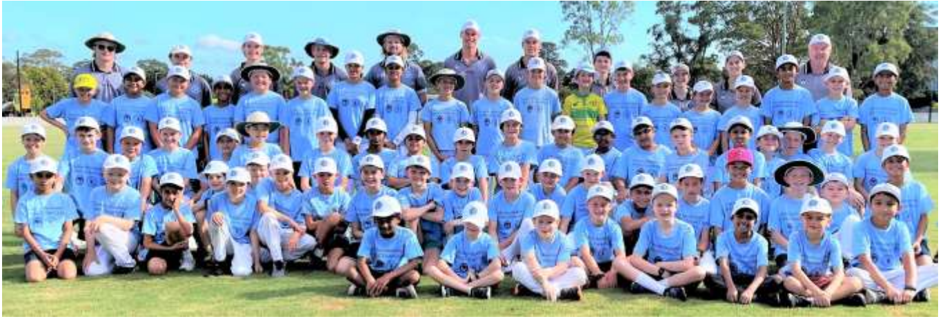
Players & coaches at our school holiday junior cricket clinic at Mark Taylor Oval, Waitara on 24-25 January 2023