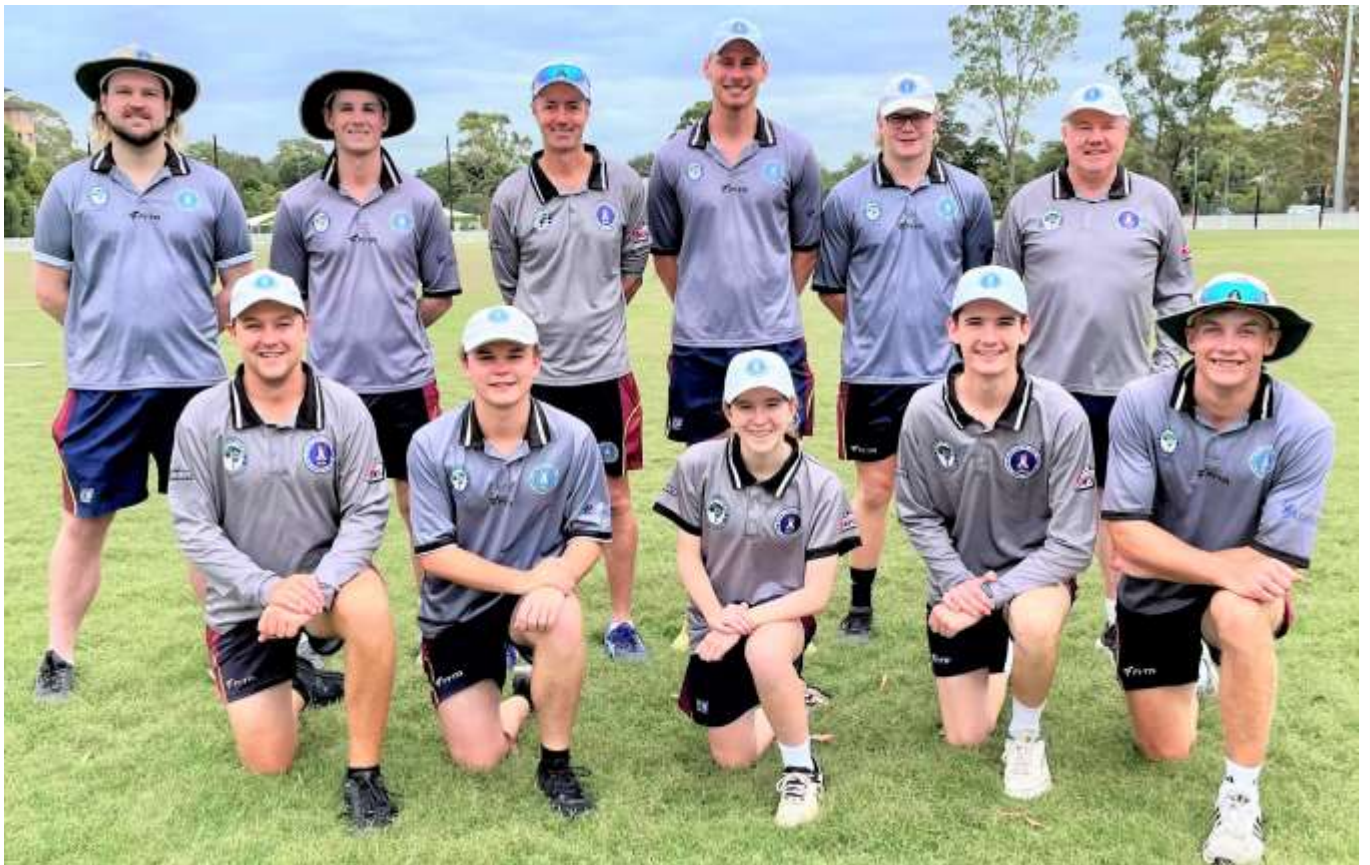
Coaches at our school holiday junior cricket clinic at Mark Taylor Oval, Waitara on 11-12 January 2023