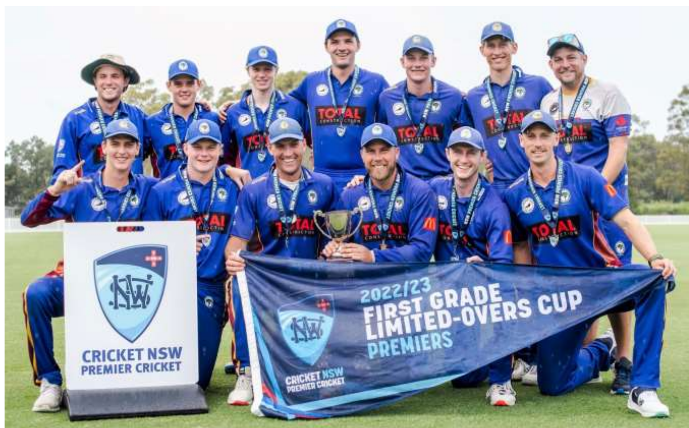
NDCC First Grade Limited-Overs champions 2022-23 at Cricket Central, Silverwater (NSW headquarters)

http://www.northerndistrictcricket.com.au/