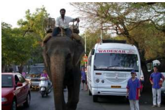
Tour Report – bit.ly/HKHDCCA-overseas-tours-Reports