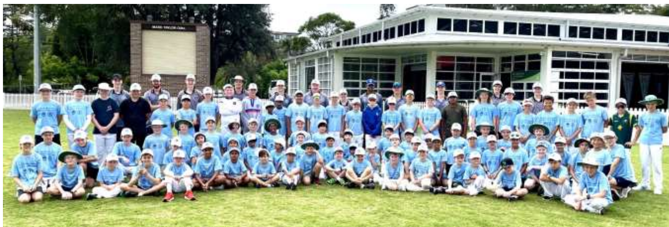
Players & coaches at school holiday junior cricket clinic – Mark Taylor Oval, Waitara on 23-24 January 2024