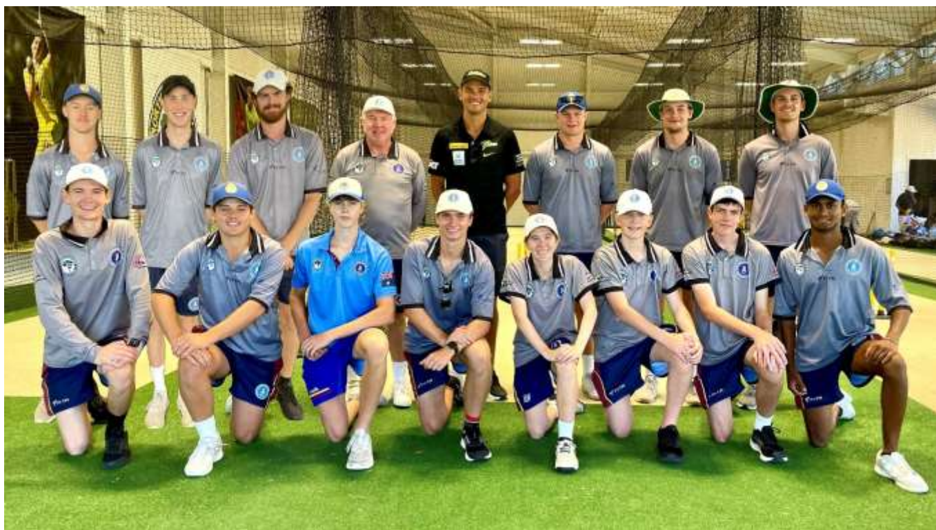
Coaches engaged at the HKHDCCA / NDCC junior cricket clinic at MTO, Waitara on 23-24 January 2024