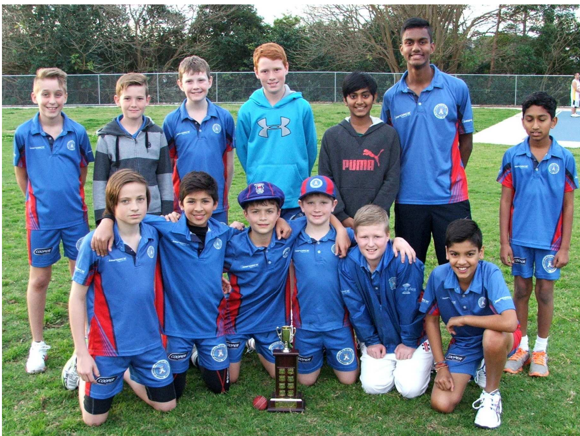
Glenn Hourigan Cup – T20 Starc team – 2014/15