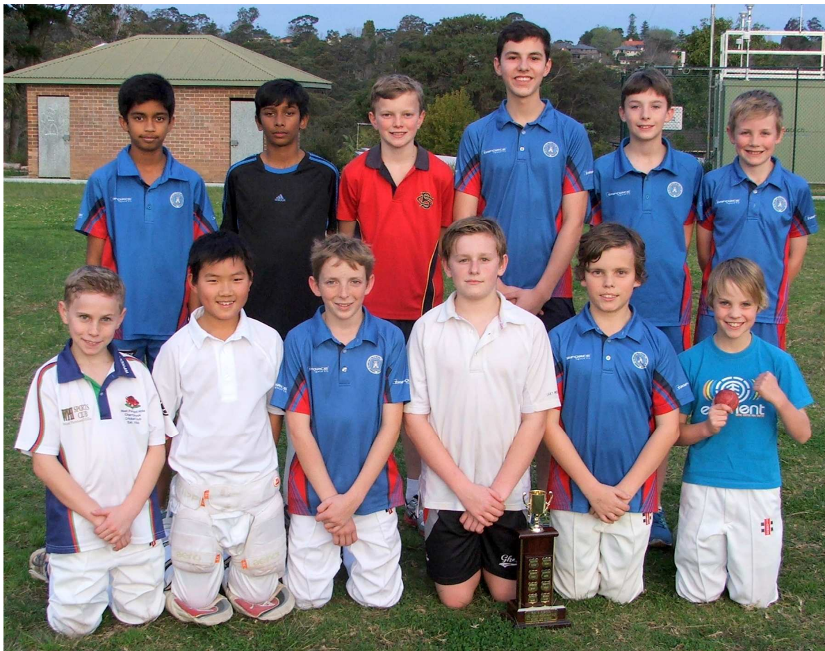
Glenn Hourigan Cup – T20 Warner team – 2014/15