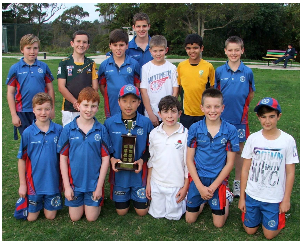
Glenn Hourigan Cup – T20 Haddin team – 2014/15