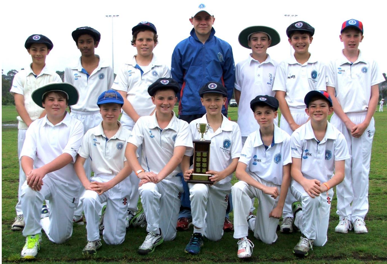
Glenn Hourigan Cup – T20 Marsh team