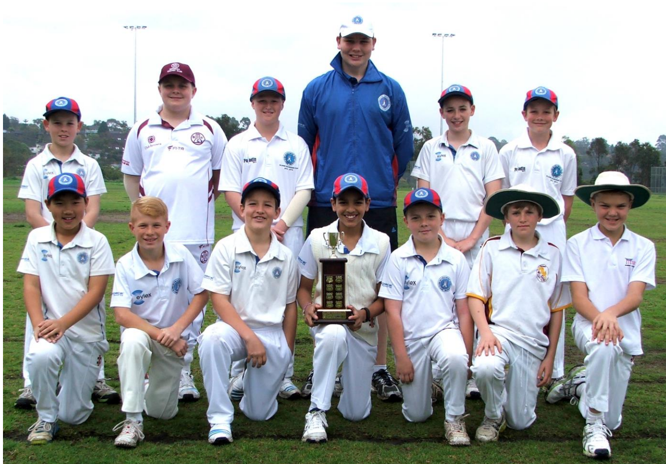
Glenn Hourigan Cup – T20 Warner team