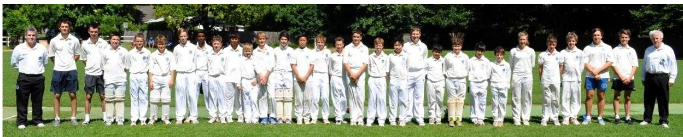
GHC teams, coaches & umpires – 2012/13