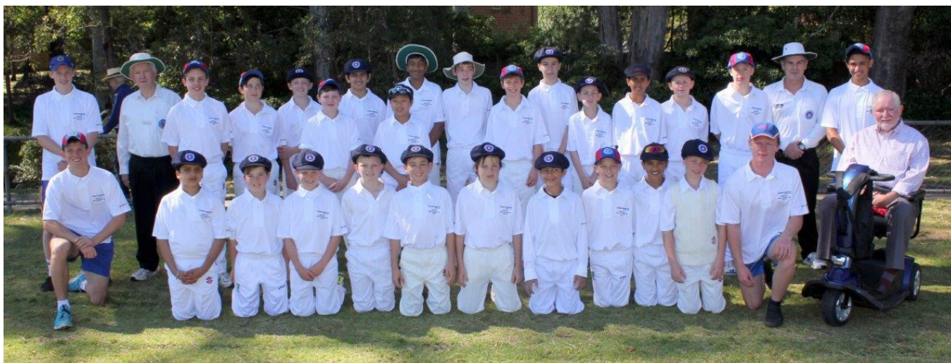
GHC teams, coaches & umpires – 2013/14