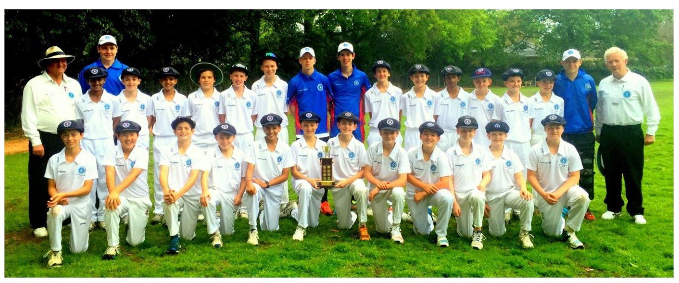
2015/16 - Karuah Park, Turramurra