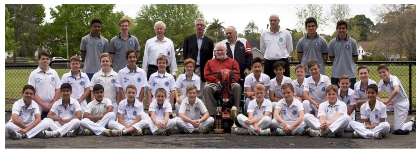
GHC East & West teams and officials - 2016/17