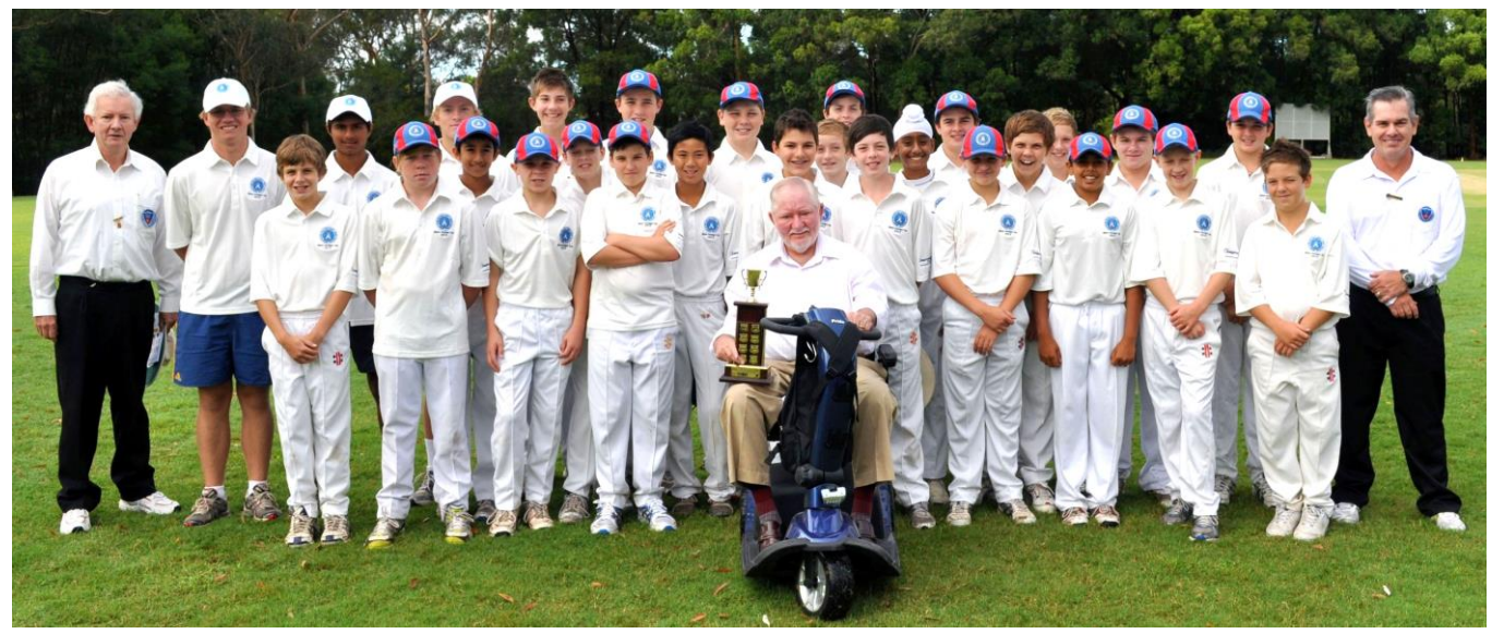
2011/12 - Kenthurst Park