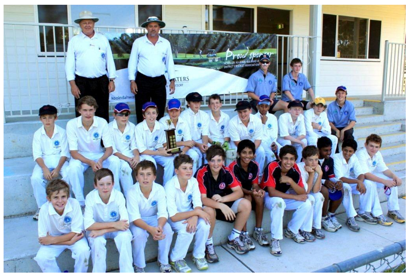
2010/11 - Les Shore Oval, Glenorie