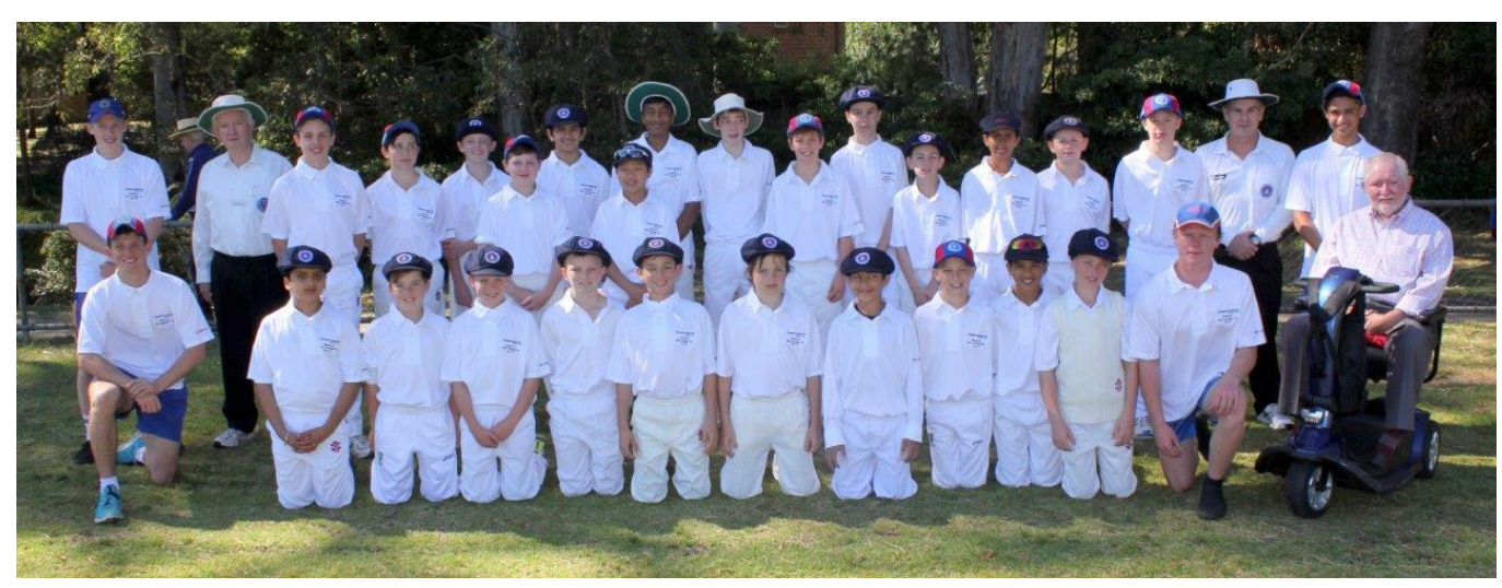
2013/14 - Karuah Park, Turramurra