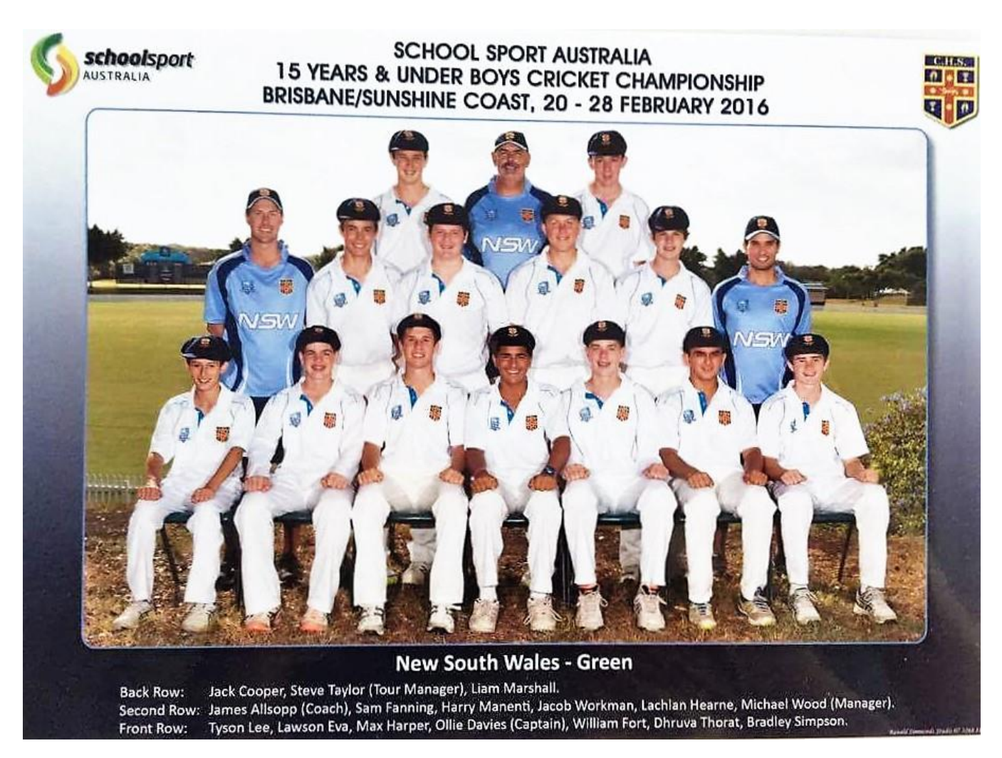
RTC winning Captain - 2015/16