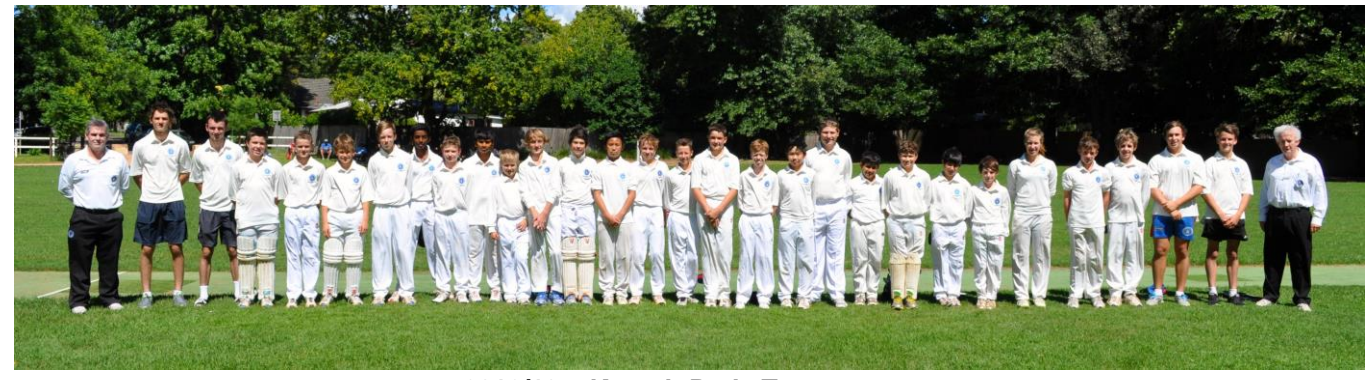
2012/13 - Karuah Park, Turramurra