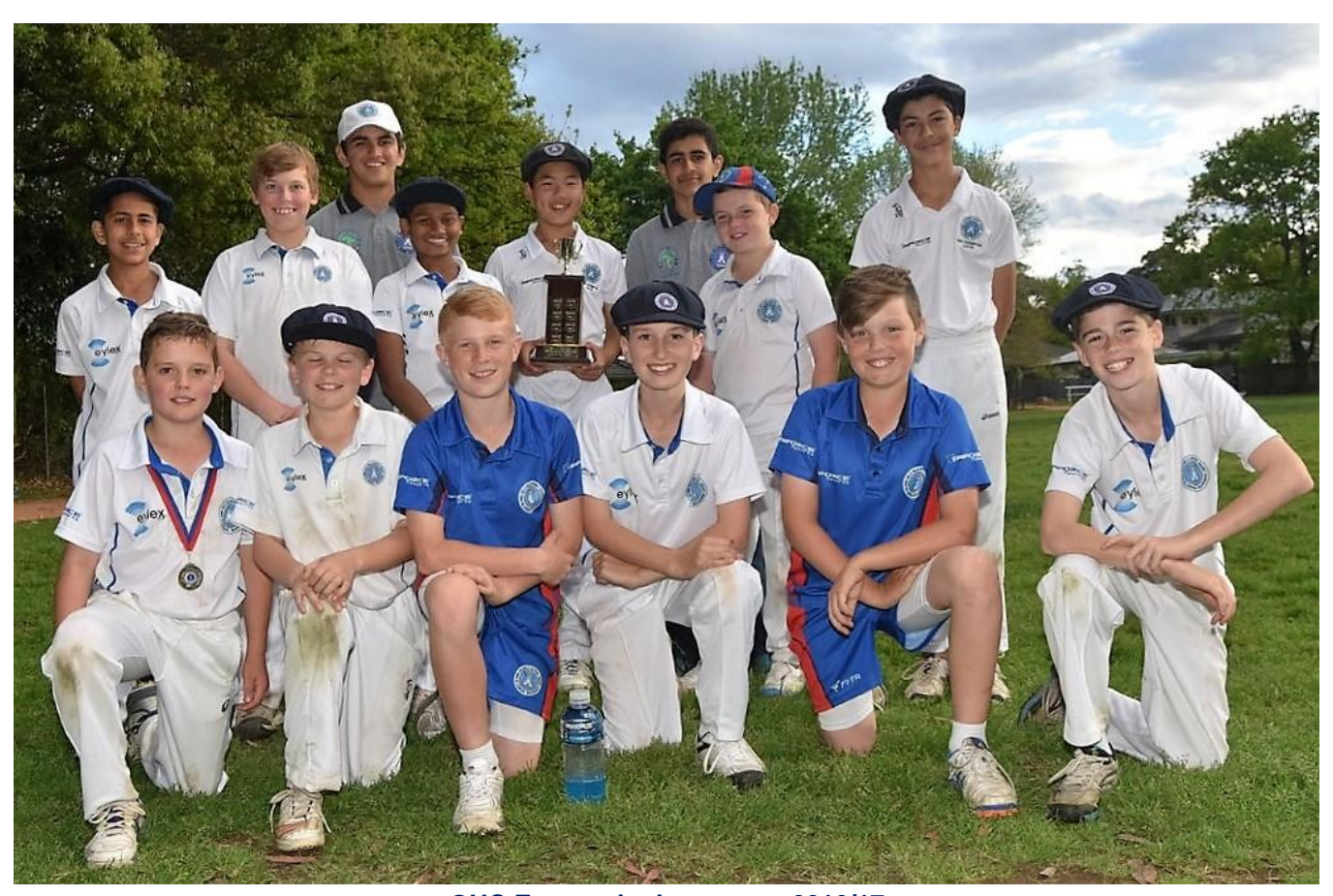
GHC East - winning team - 2016/17