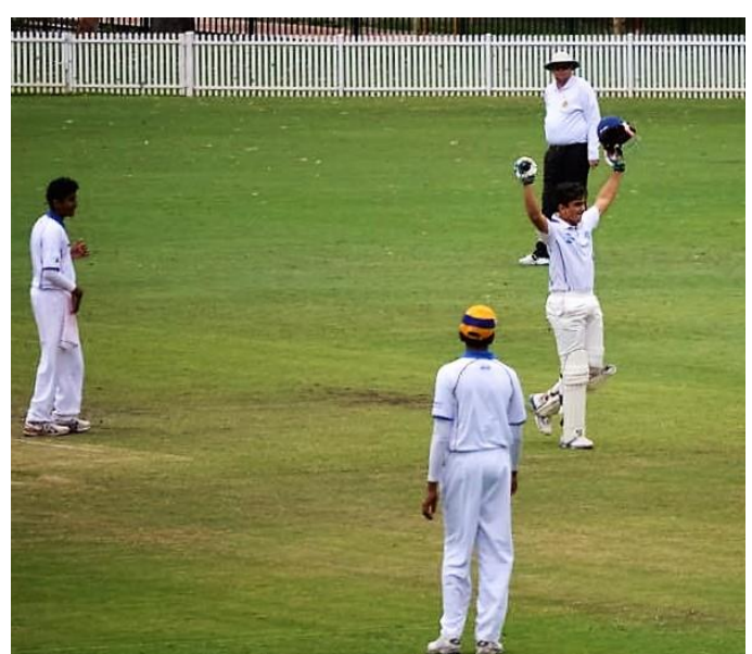
Dhruva's 151 v. Fairfield-Liverpool – 2015/16 (Record Weblin Shield aggregate – 380 runs @ 76)