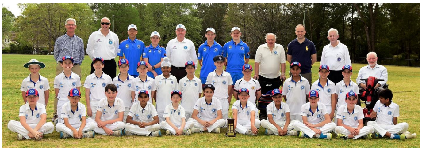
Below – 2017-18 GHC teams at Karuah Park