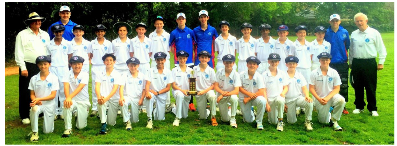
2015-16 GHC teams at Karuah Park, Turramurra