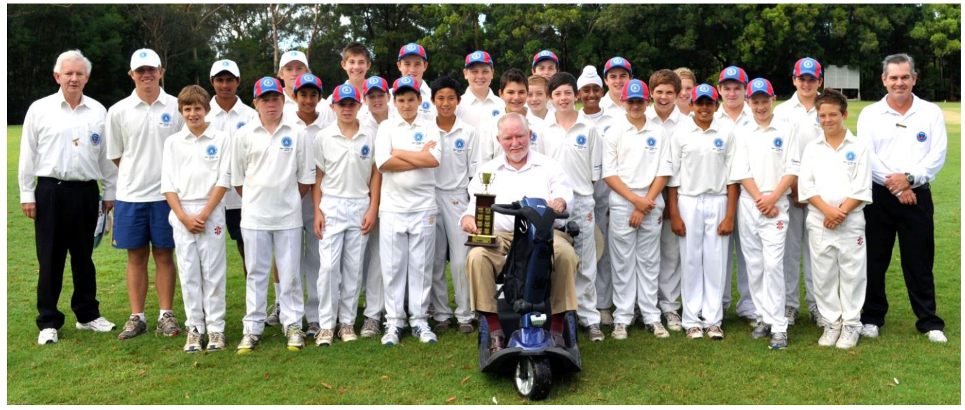
2011-12 GHC teams at Kenthurst Oval