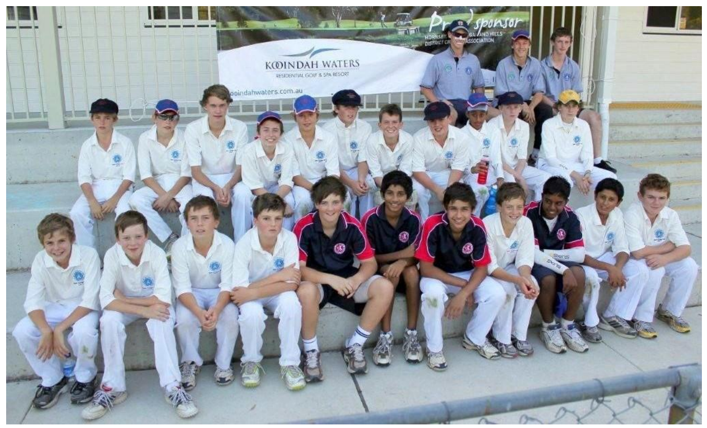
2010-11 GHC teams at Les Shore Reserve, Glenorie