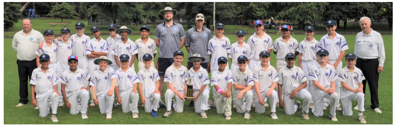
Above – 2020-21 GHC teams at Karuah Park