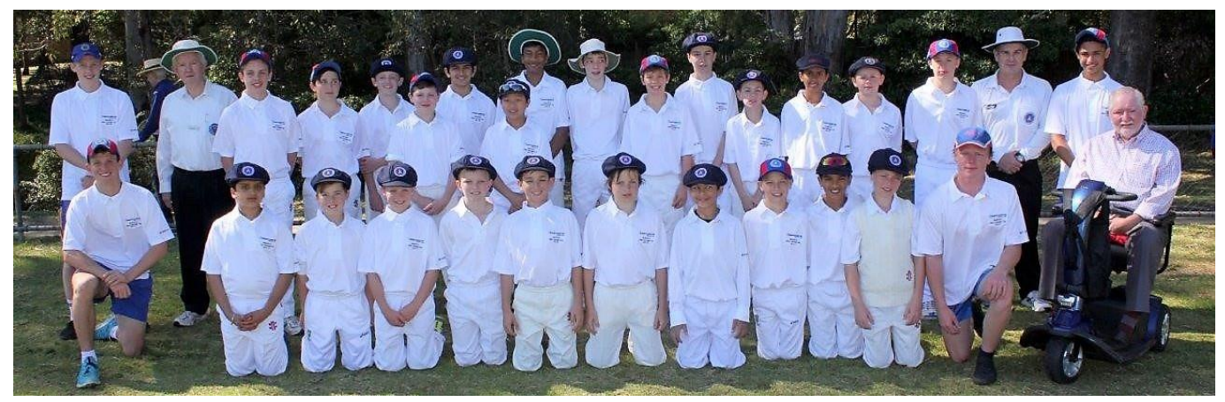
2013-14 GHC teams at Karuah Park, Turramurra