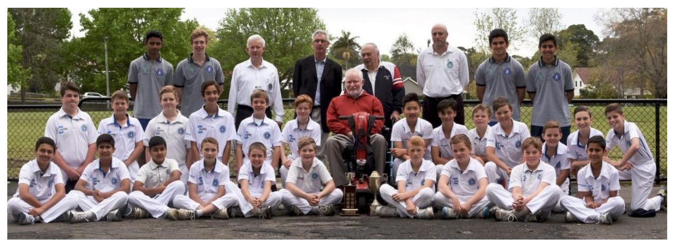
2016-17 GHC teams at Karuah Park, Turramurra