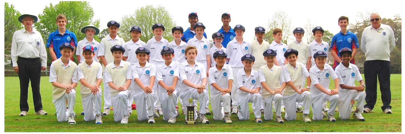
2014-15 GHC teams at Karuah Park, Turramurra