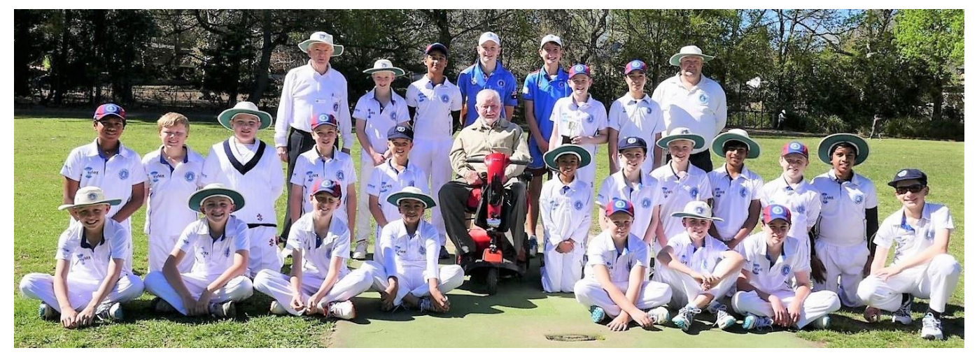
Above – 2018-19 GHC teams at Karuah Park