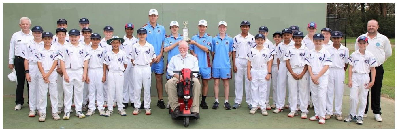
Below – 2019-20 GHC teams at Auluba Oval