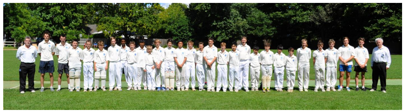
2012-13 GHC teams at Karuah Park, Turramurra