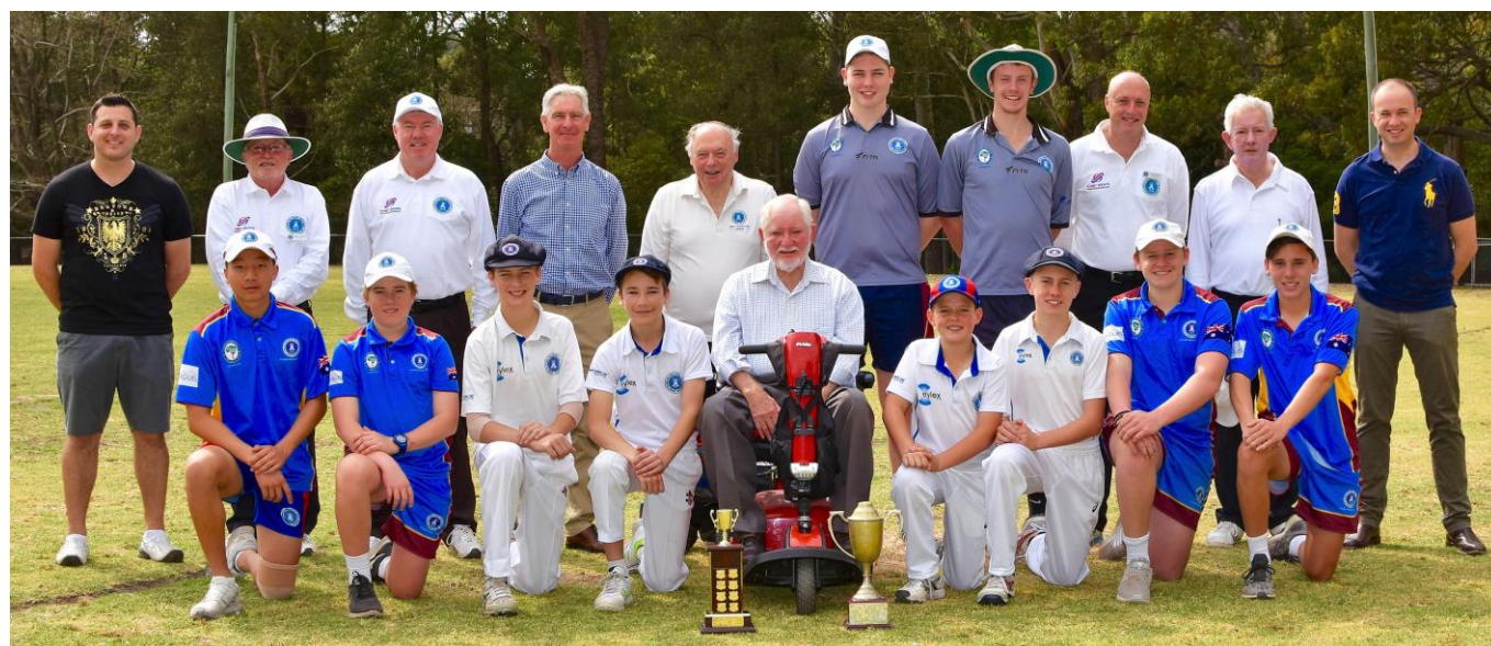
RTC and GHC Captains, Coaches, Umpires & Special Guests – 2017-18 (20 th Anniversary – RTC)

A life well lived and an innings of the highest quality