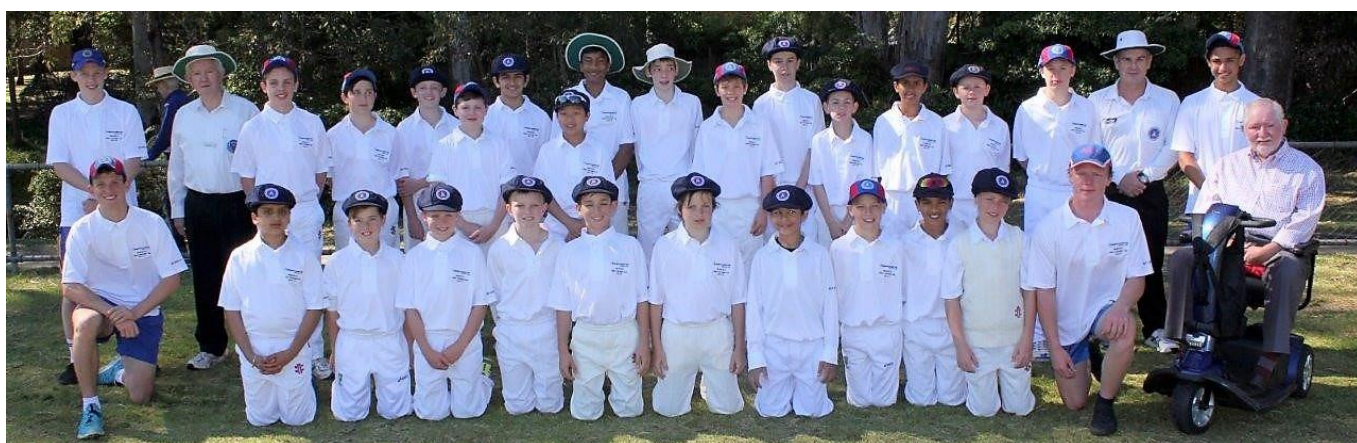
2013-14 GHC teams at Karuah Park, Turrumurra