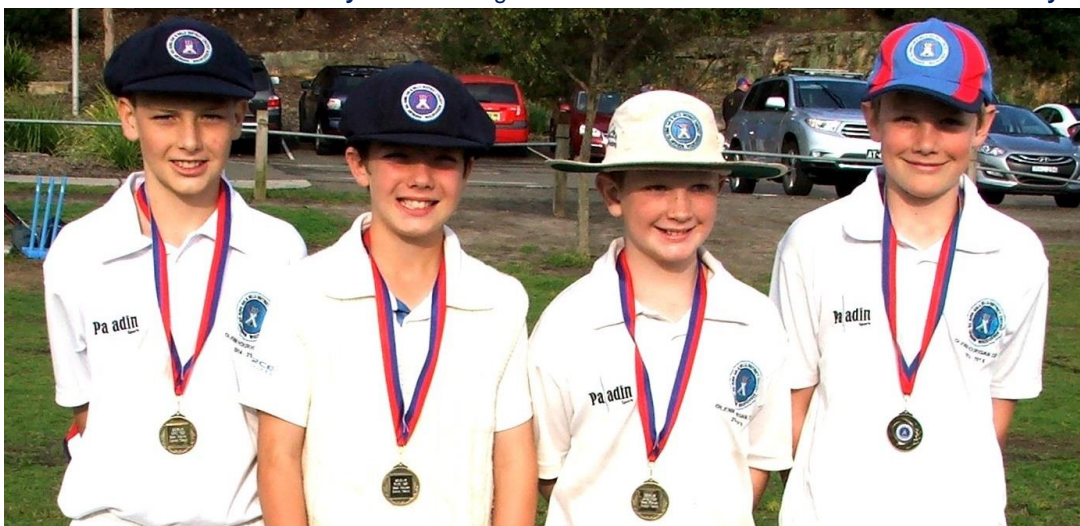
GHC T20 team awards 2015-16