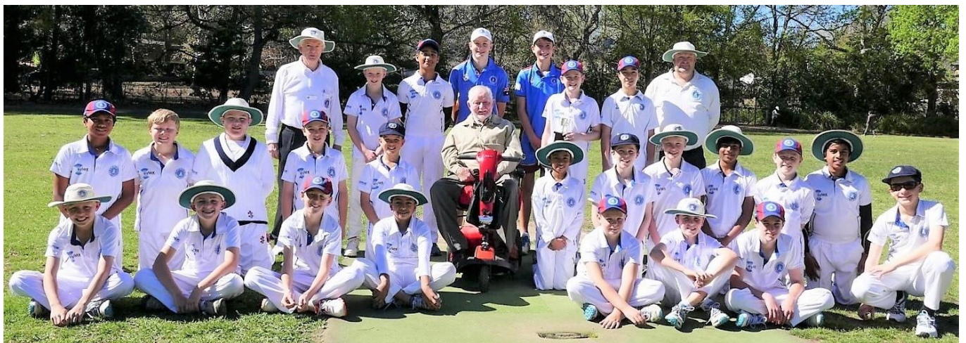
Above – 2018-19 GHC teams at Karuah Park