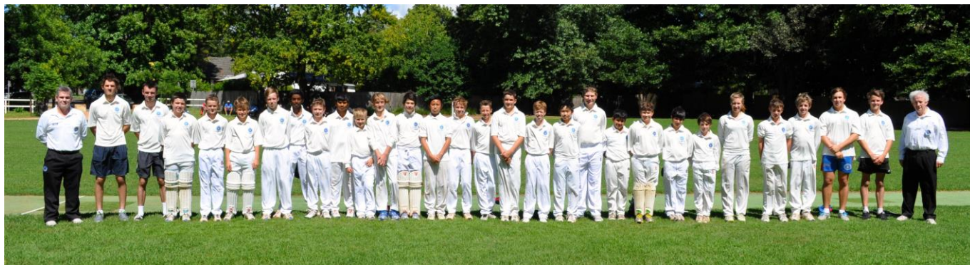
2012-13 GHC teams at Karuah Park, Turrumurra