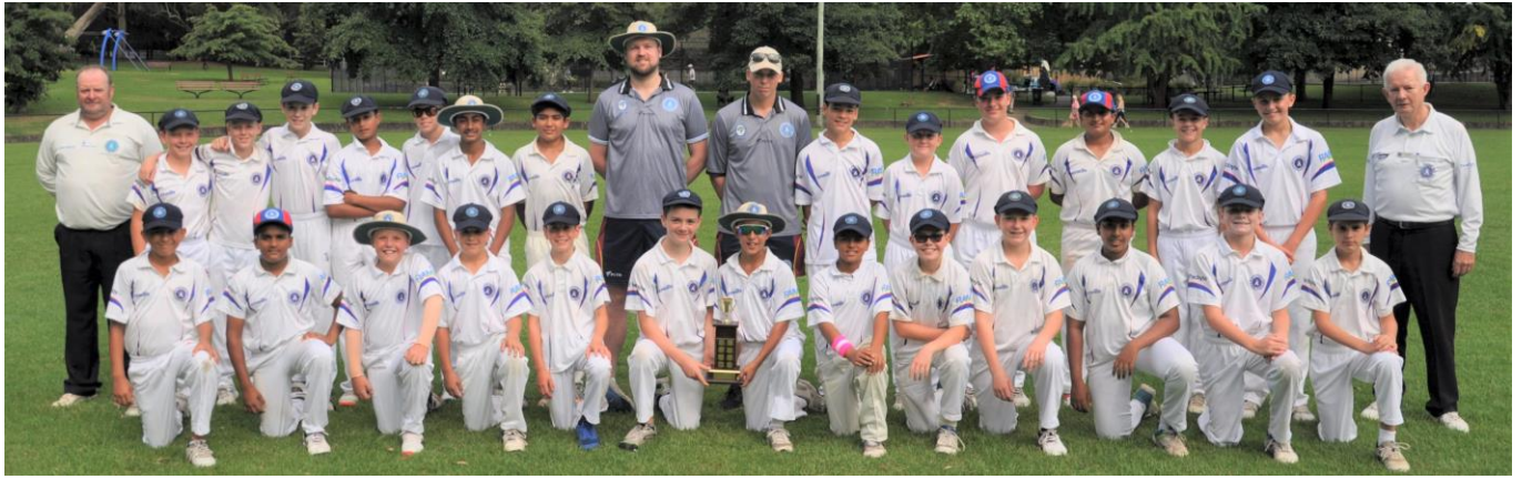
Above – 2020-21 GHC teams at Karuah Park