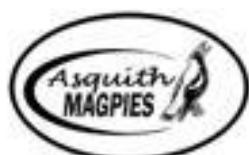
Asquith Rugby League Cricket Club