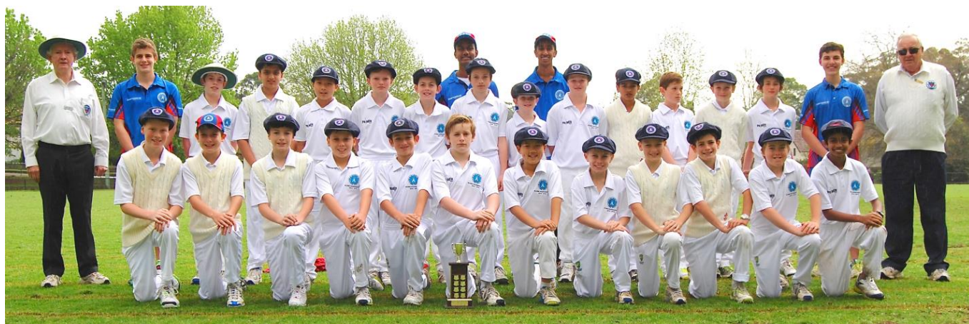
2014-15 GHC teams at Karuah Park, Turrumurra