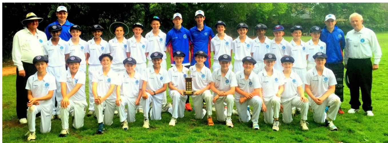
2015-16 GHC teams at Karuah Park, Turrumurra