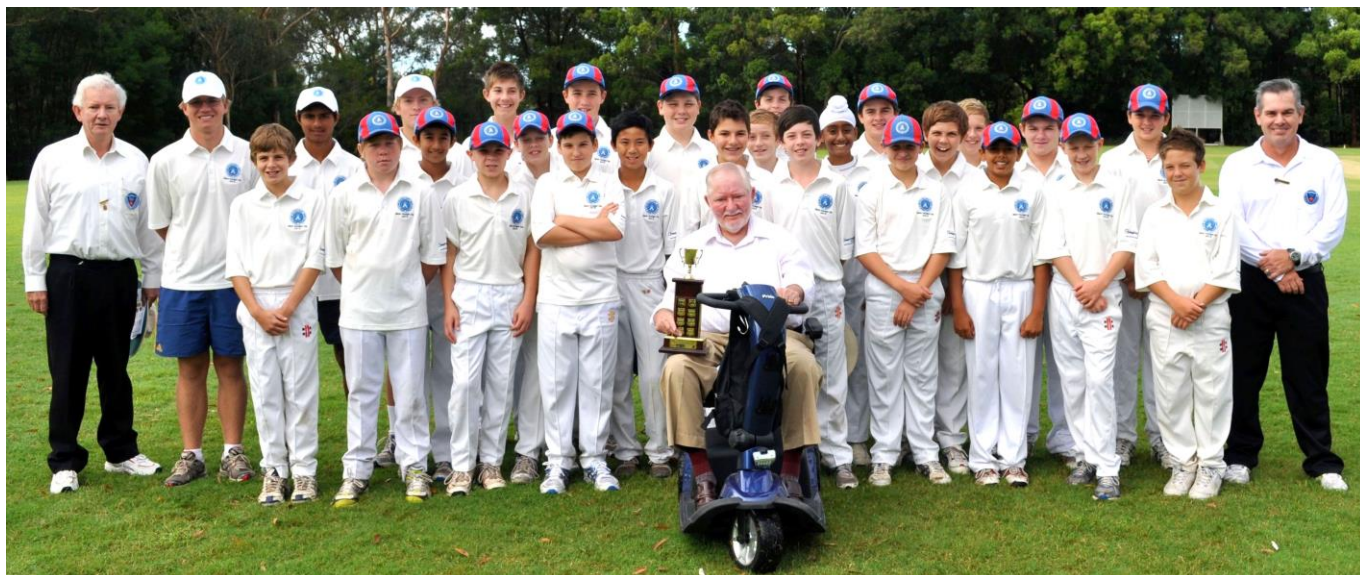
2011-12 GHC teams at Kenthurst Oval