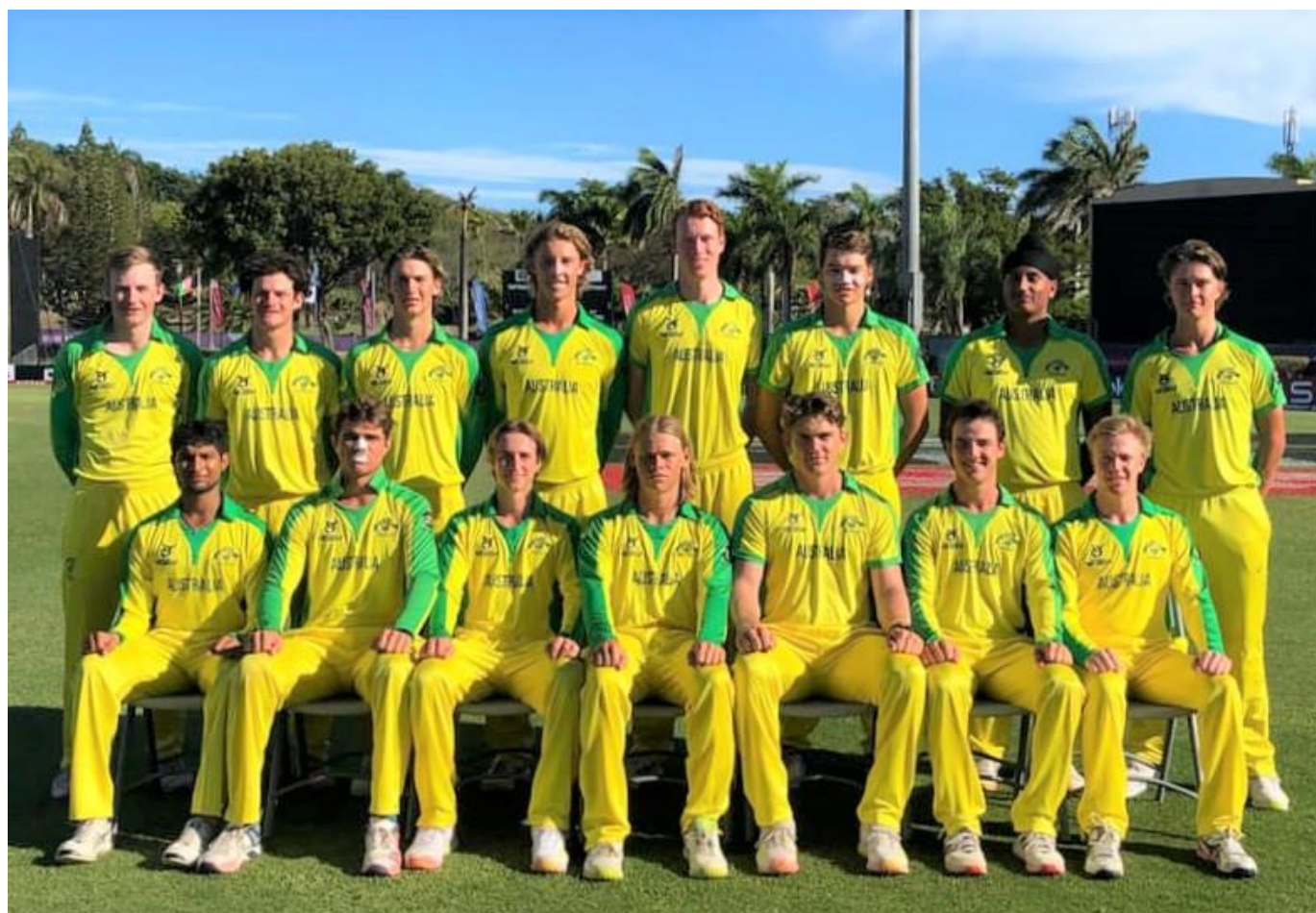
Australian U/19 World Cup team in 2021-22