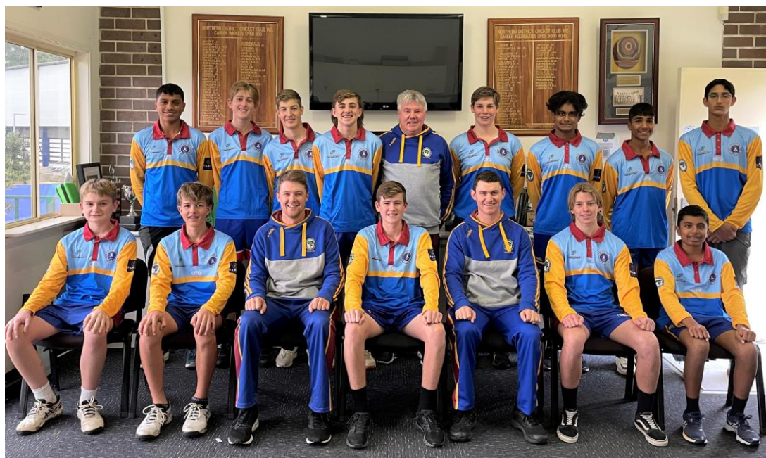
Coaches' Association / Northern District CC U/15 Academy team – Sunshine Coast tour 2021