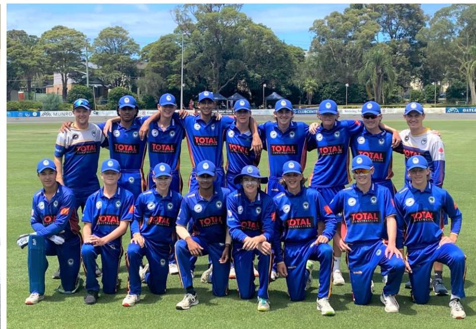
Northern District CC – U/16 A. W. Green Shield team in 2021-22