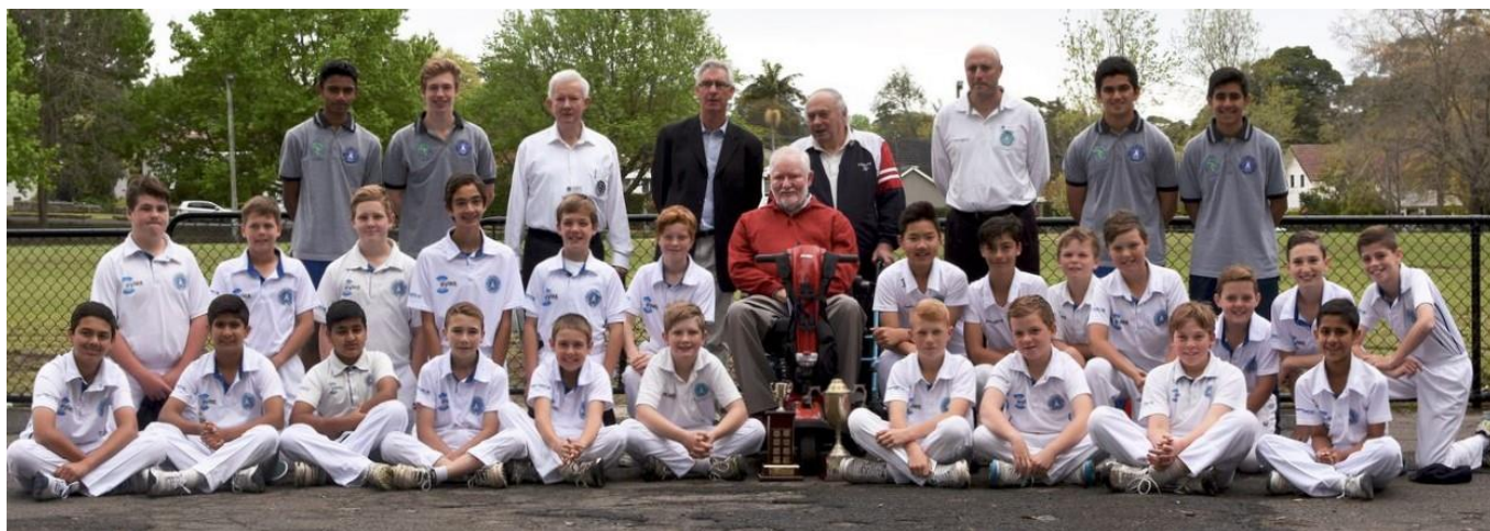
2016-17 GHC teams at Karuah Park, Turrumurra