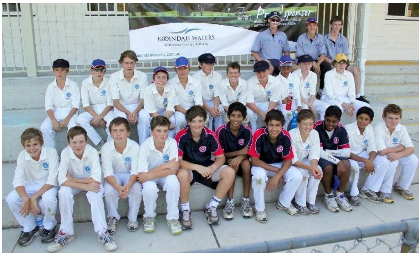
2010-11 GHC teams at Les Shore Reserve, Glenorie