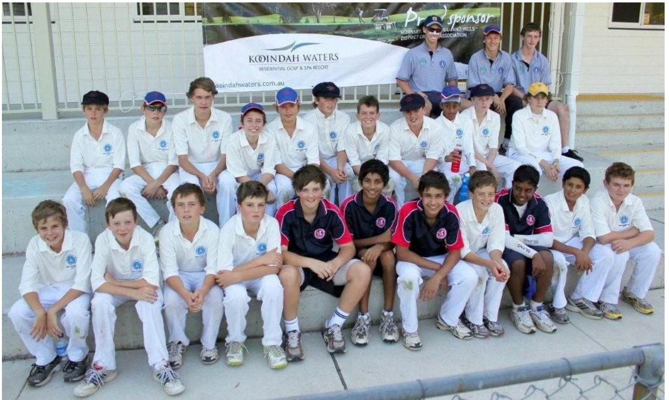
Below – 2010-11 GHC teams at Les Shore Res. Glenorie