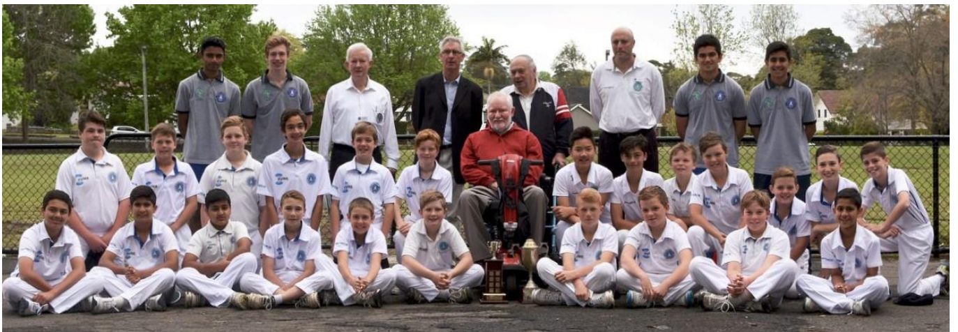
Below – 2016-17 GHC teams at Karuah Park