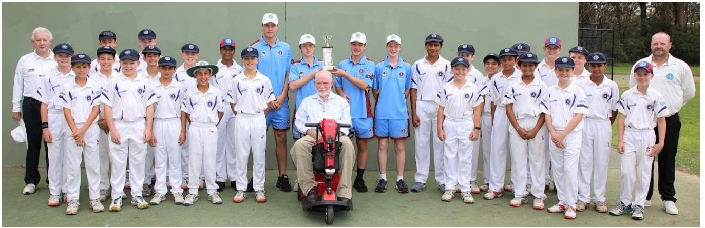
Above – 2019-20 GHC teams at Auluba Oval