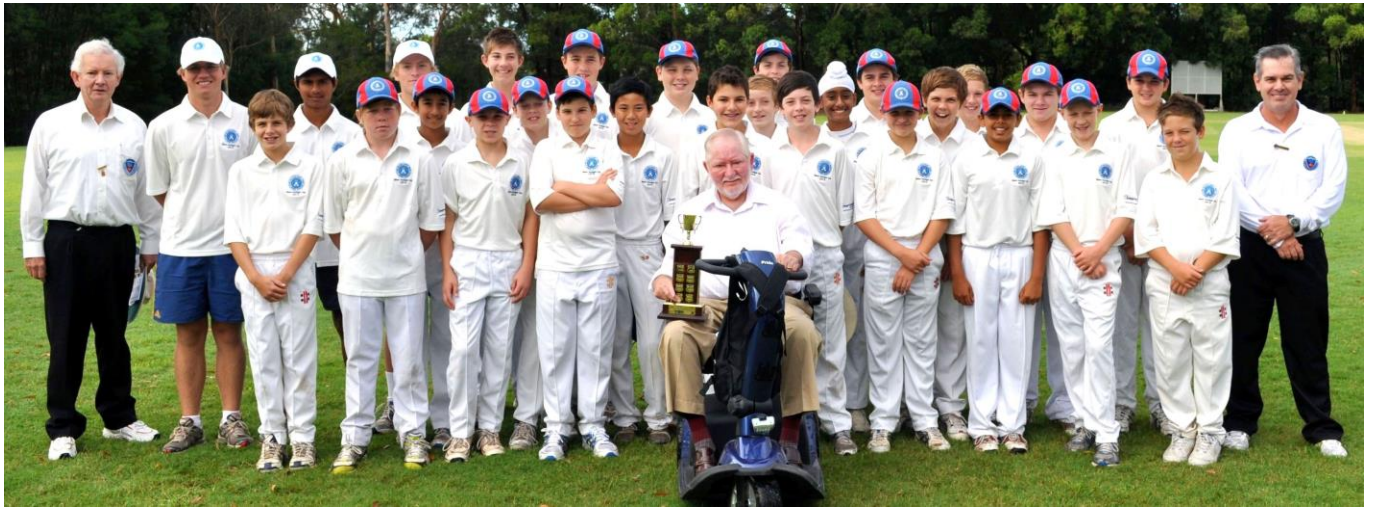
Above – 2011-12 GHC teams at Kenthurst Oval