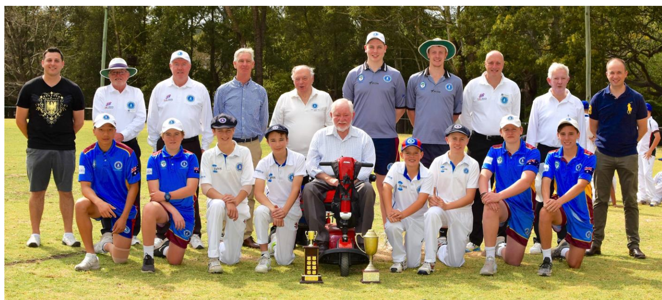
RTC and GHC Captains, Coaches, Umpires & Special Guests in 2017-18 (20 th anniversary RTC match)