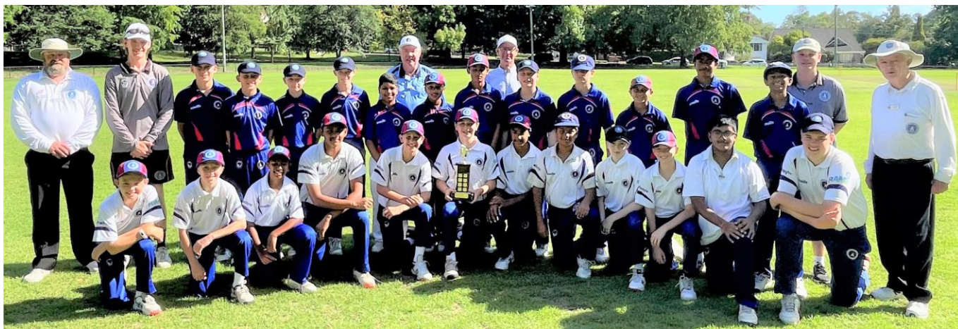
2022-23 GHC teams at Karuah Park