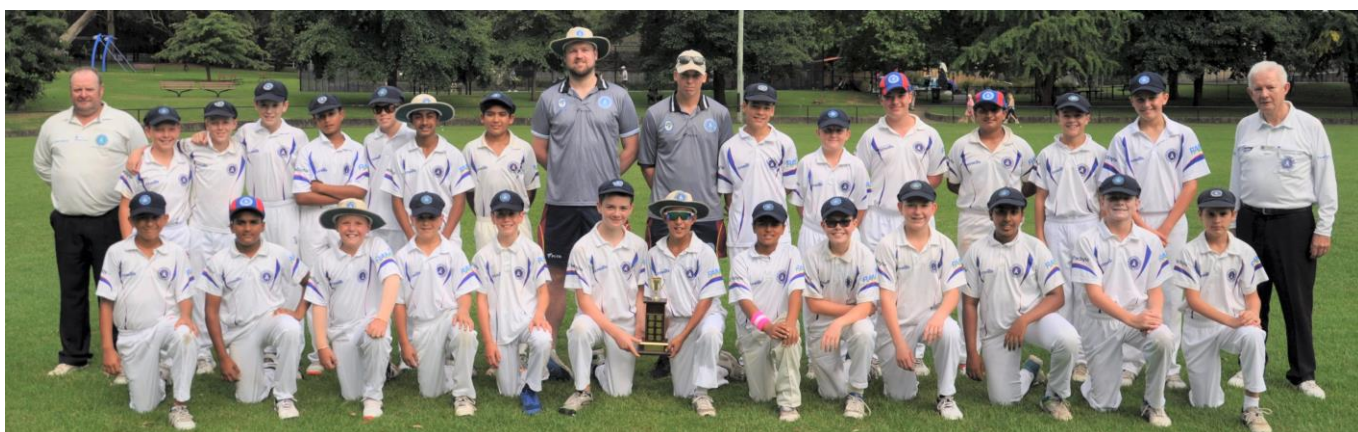
2020-21 GHC teams at Karuah Park