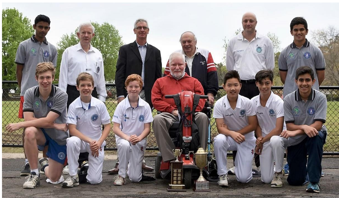
Captains, Coaches, Umpires & special guests at GHC match at Karuah Park, Turramurra on 25 September 2016