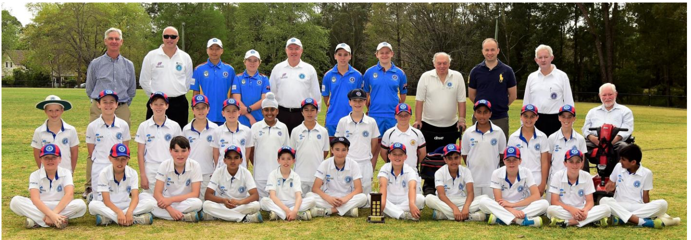
Above – 2017-18 GHC teams at Karuah Park