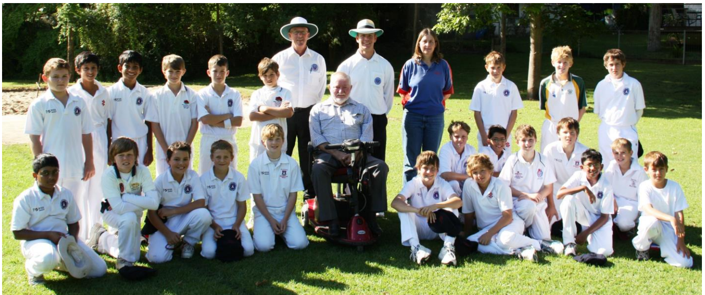
2009-10 GHC teams at Bannockburn Oval, Pymble