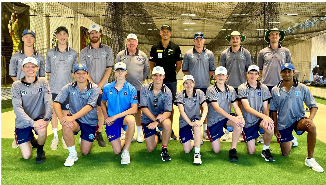
Coaches engaged at the HKHDCCA / NDCC junior cricket clinic at MTO, Waitara on 23-24 January 2024