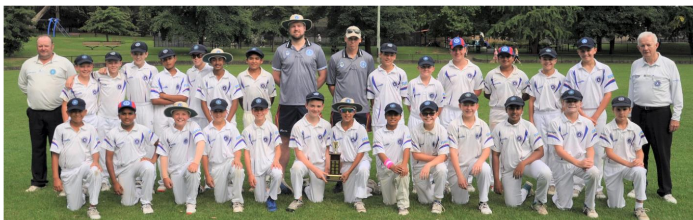
2020-21 GHC teams at Karuah Park