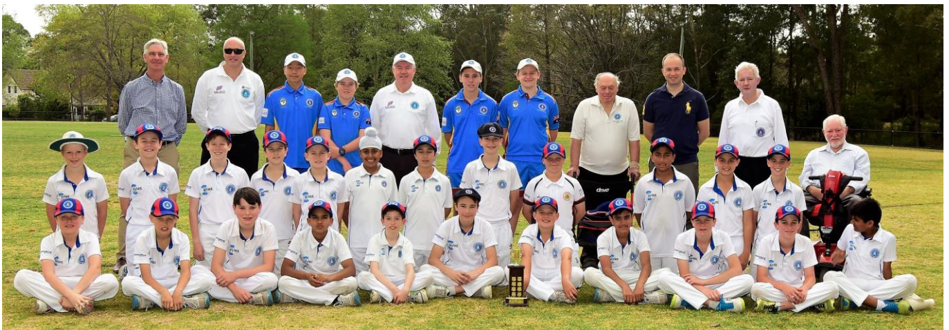
Above – 2017-18 GHC teams at Karuah Park