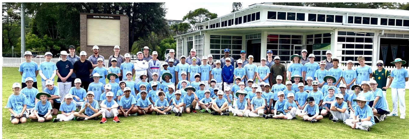
Players & coaches at school holiday junior cricket clinic – Mark Taylor Oval, Waitara on 23-24 January 2024