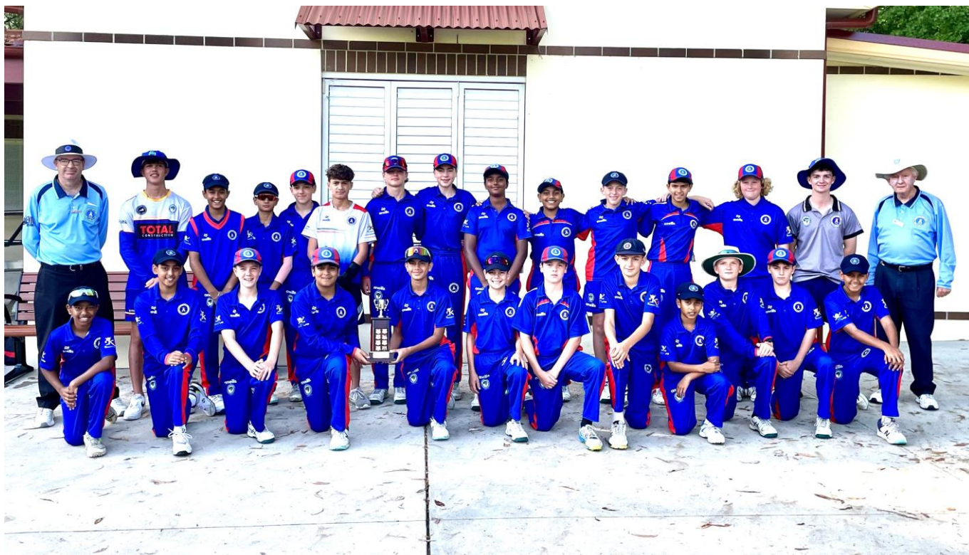
2023-24 GHC teams at Karuah Park