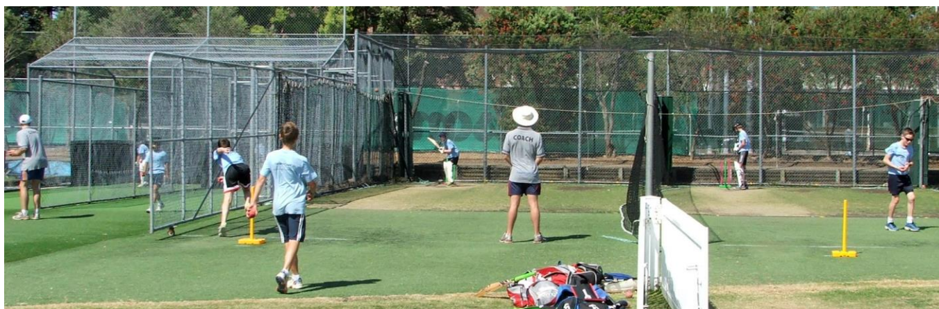
Coaching in the turf and astro nets at Mark Taylor Oval, Waitara