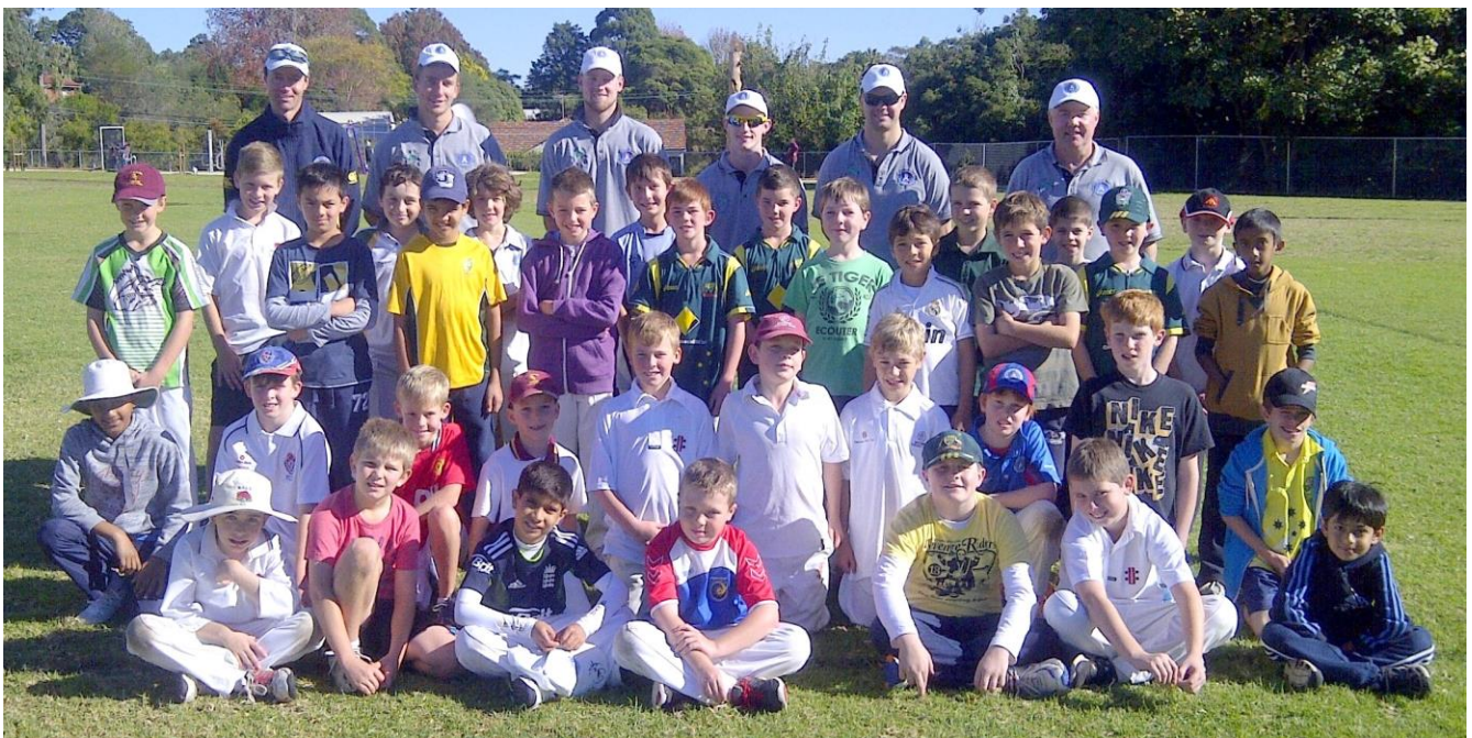
Players and coaches at 10.30am change-over between sessions on 26-May-13 (several players missed this photo)