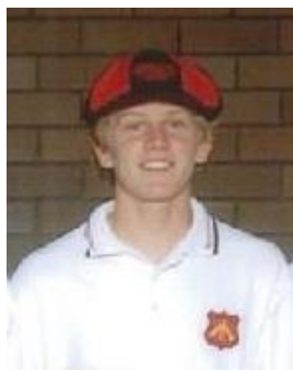
Normanhurst CC 2002-05

Normanhurst CC and HK&HDCA reps. to First Class cricket with NSW and Tasmania, and international cricket