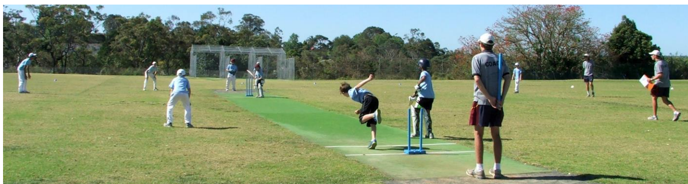
Match play during the Montview Oval clinic in September 2013