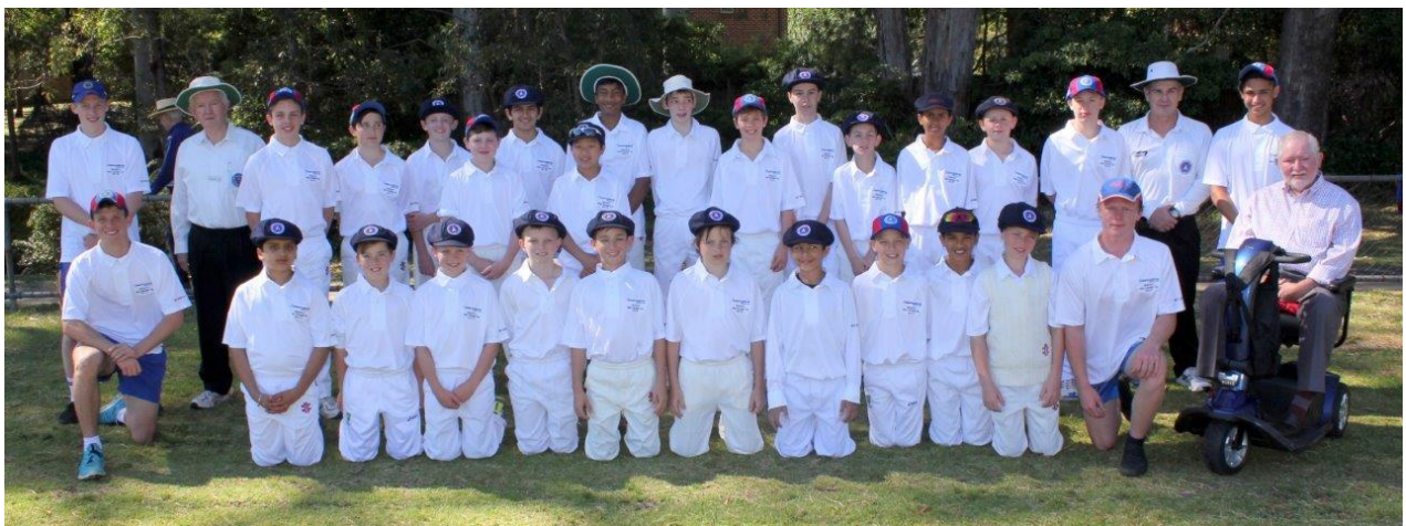
Glenn Hourigan Cup players, coaches & umpires – 2013/14