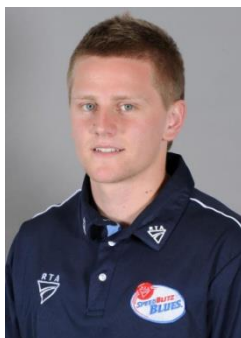
NSW Blues 2010-12