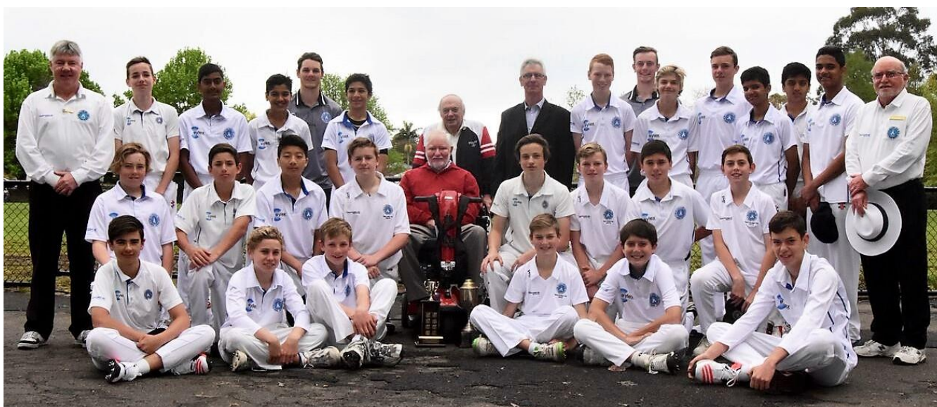
RTC East & West teams, Coaches, Umpires & Special Guests at Turramurra Oval on 25 September 2016