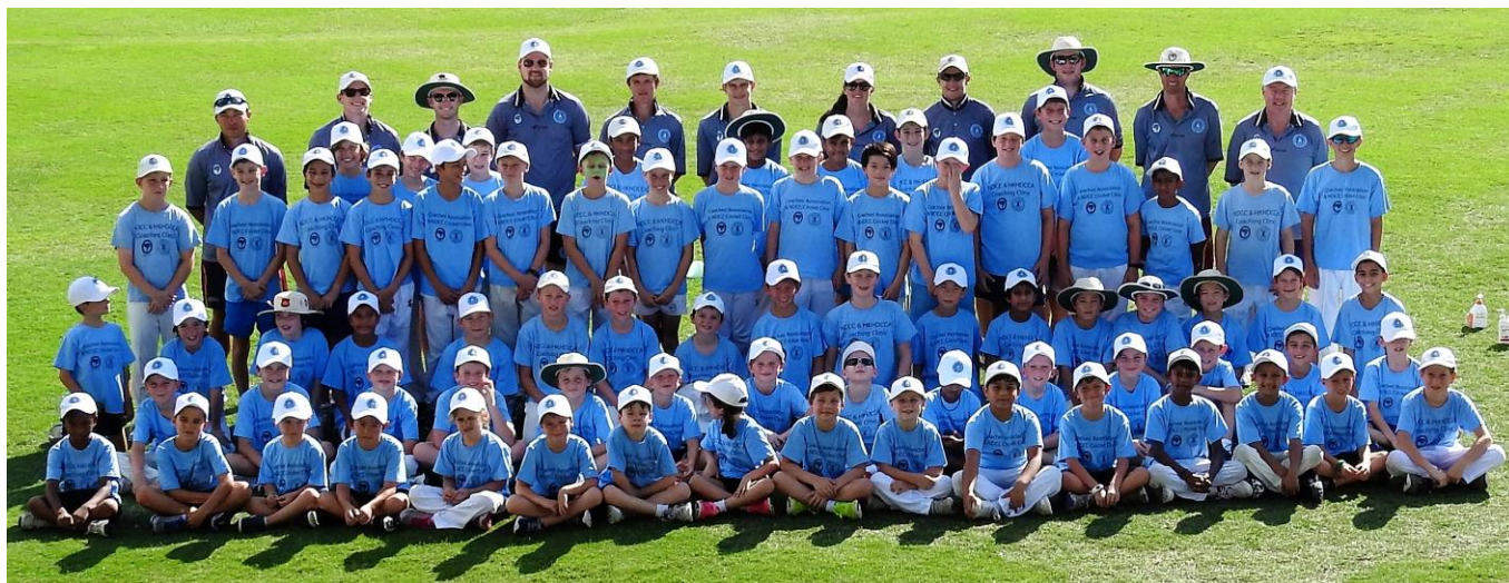
Group photo of the players and coaches – Mark Taylor Oval, Waitara – 11 January 2017