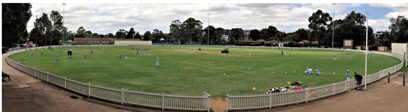
Terrific panoramic photo showing 5 matches taking place concurrently – Mark Taylor Oval, Waitara – 12 January 2017