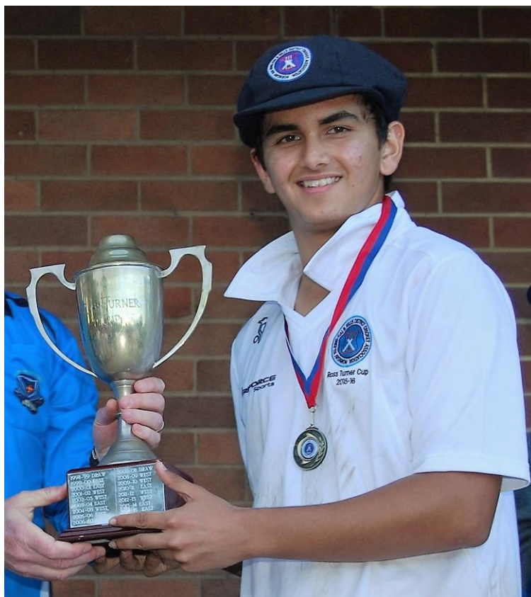
RTC winning Captain – 2015/16