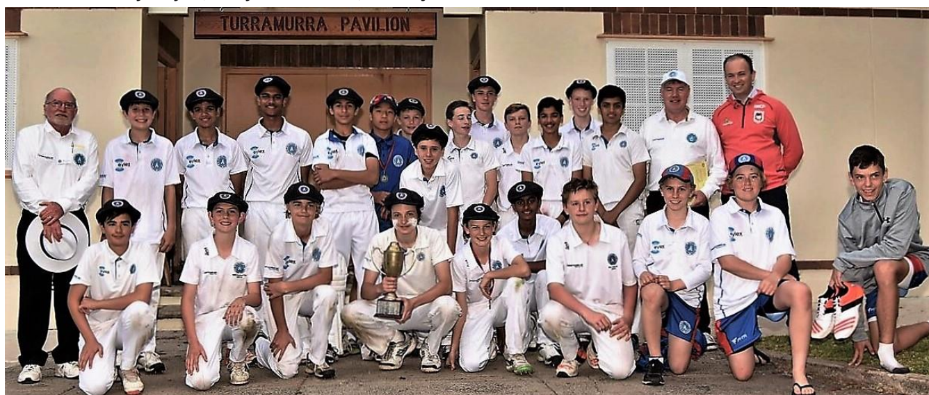
Matt Kean MP – Member for Hornsby, with the RTC players and umpires after the match