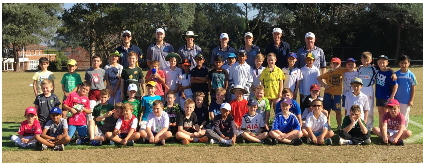
Players and coaches at Rosewood Oval, Barker College – 22 May 2016