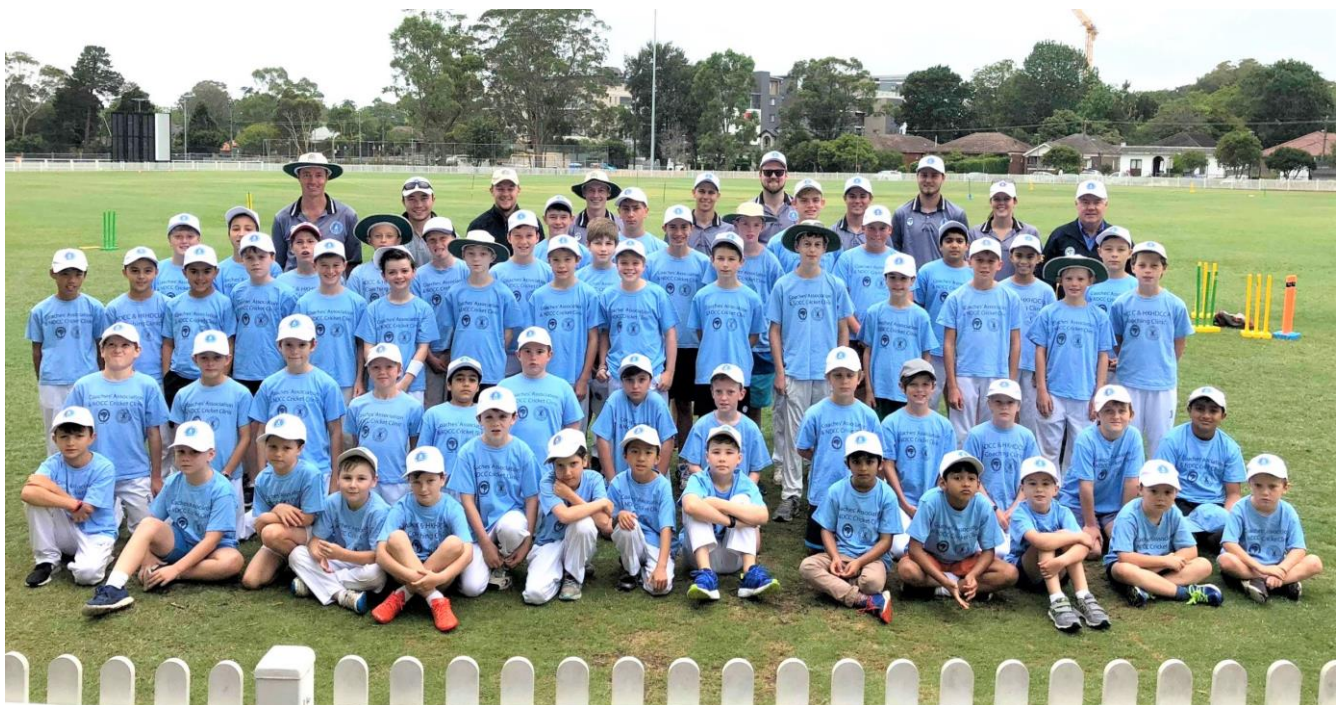
Group photo of the players and coaches – Mark Taylor Oval, Waitara – 10 January 2018