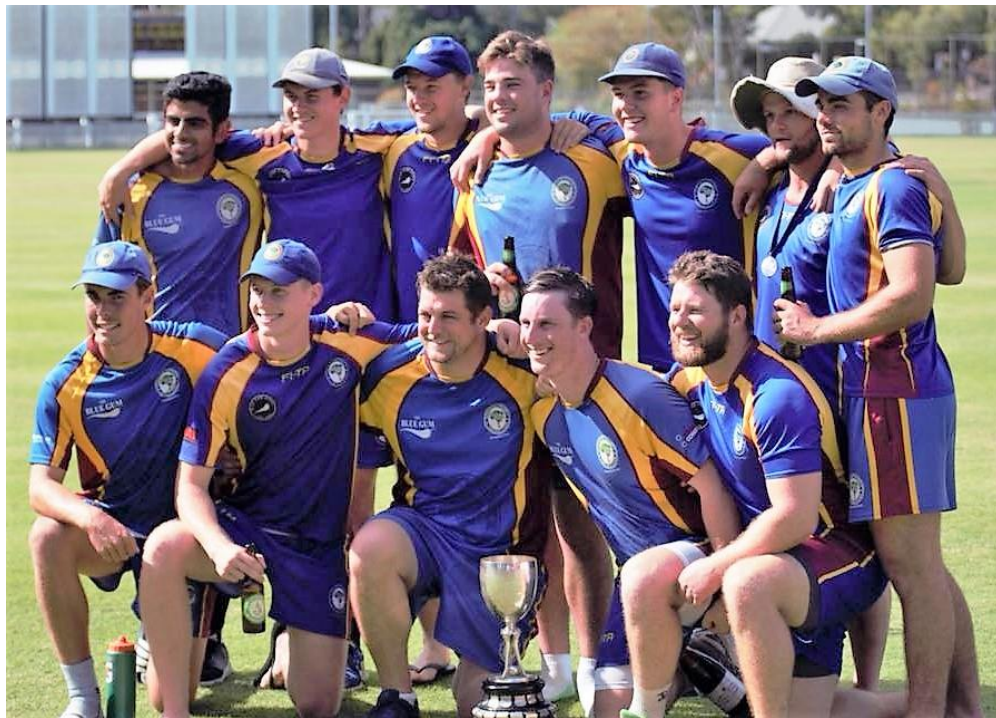
Northern District CC – Second Grade Premiers – 2017/18