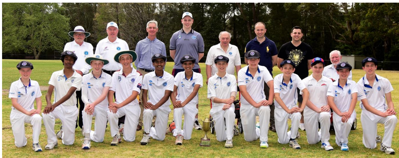
RTC West team – 2017/18