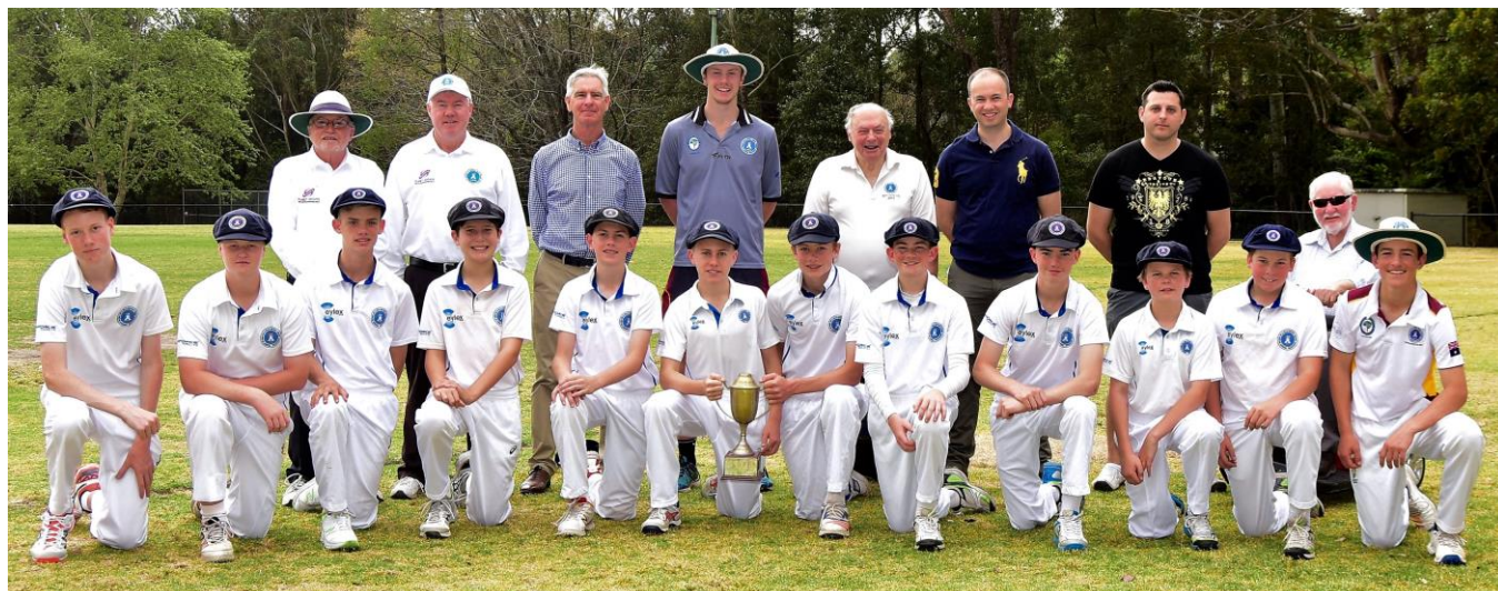
RTC East team – 2017/18