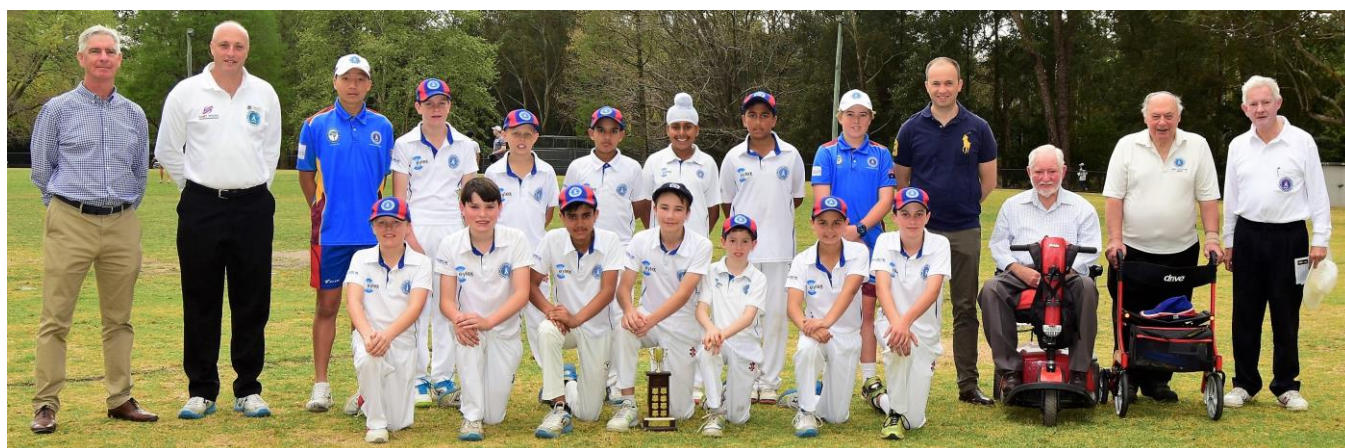
GHC East team – 2017/18