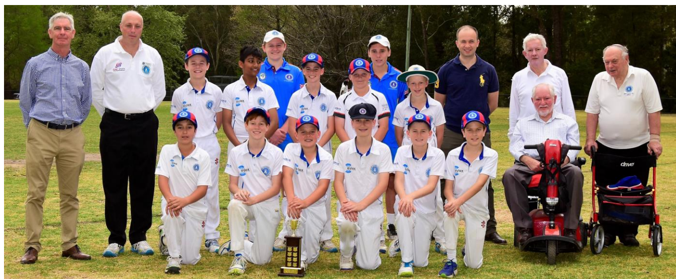
GHC West team – 2017/18