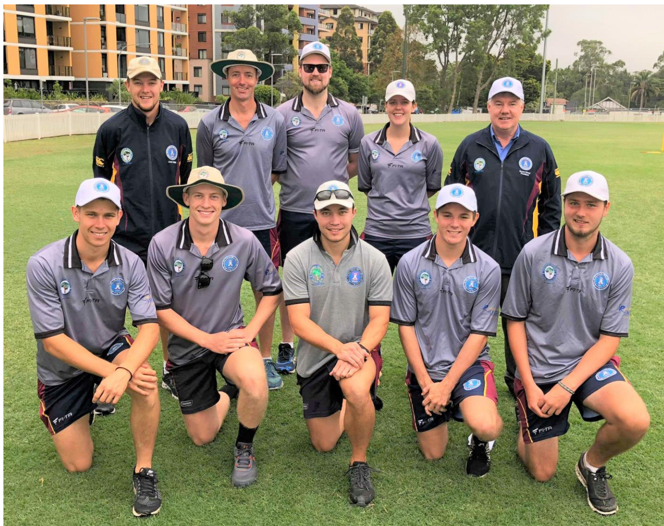
Coaches at Mark Taylor Oval, Waitara – 10 January 2018