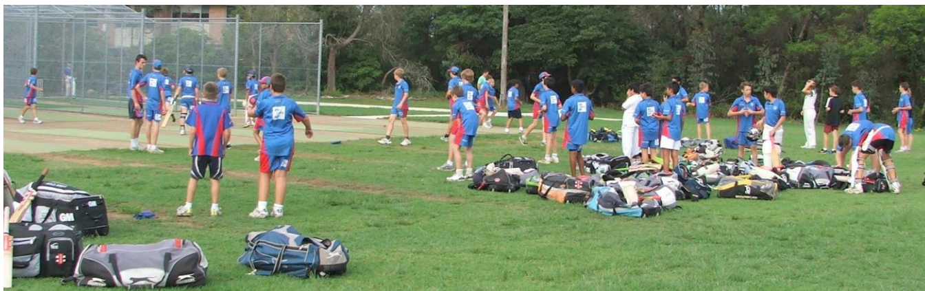
RTC and GHC training session at James Park, Hornsby on 13 February 2013