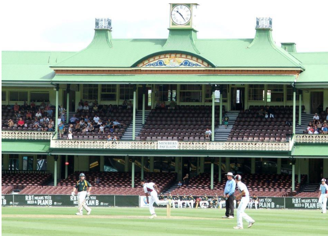
Bruce Wood umpiring at SCG on 17 February 2013 (Cricket NSW U/14 State Challenge Final)