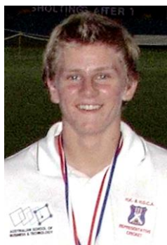
HK&HDCA reps 2001-06