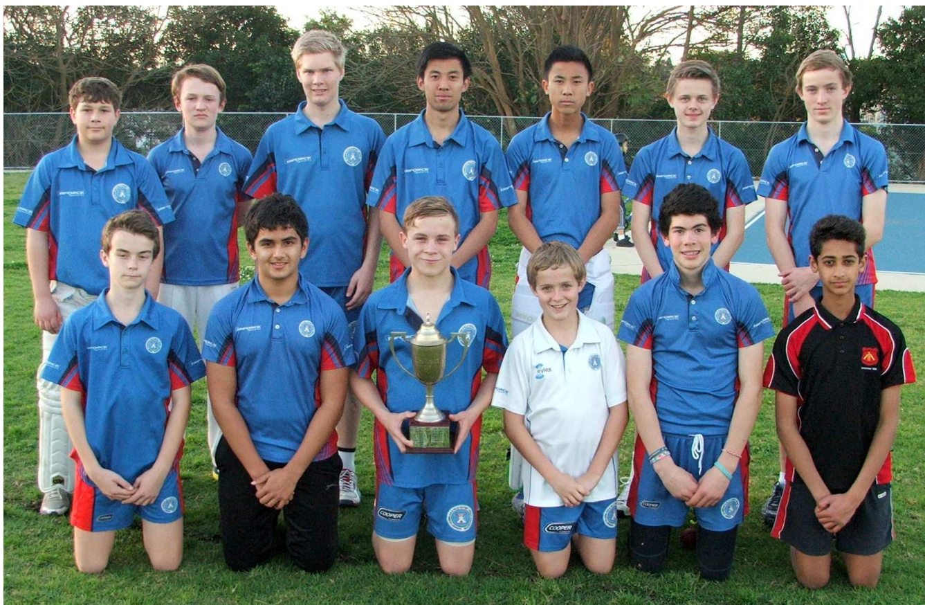
RTC East team – 2014/15