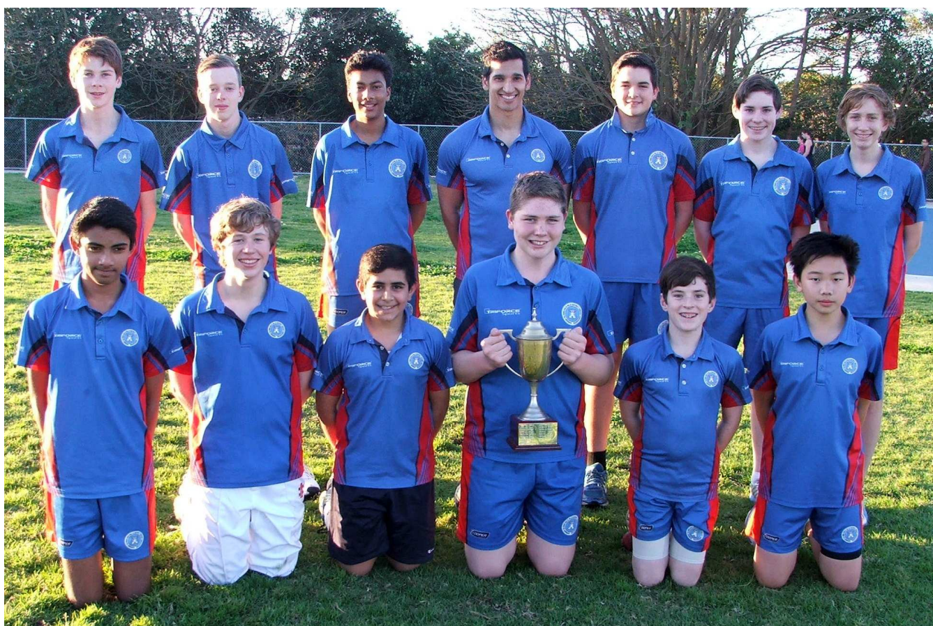
RTC West team – 2014/15