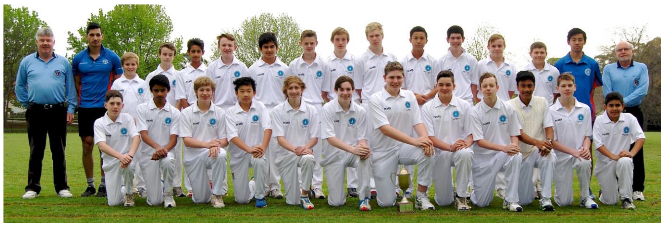
2014-15 RTC East & West teams, coaches & umpires at Turramurra Oval