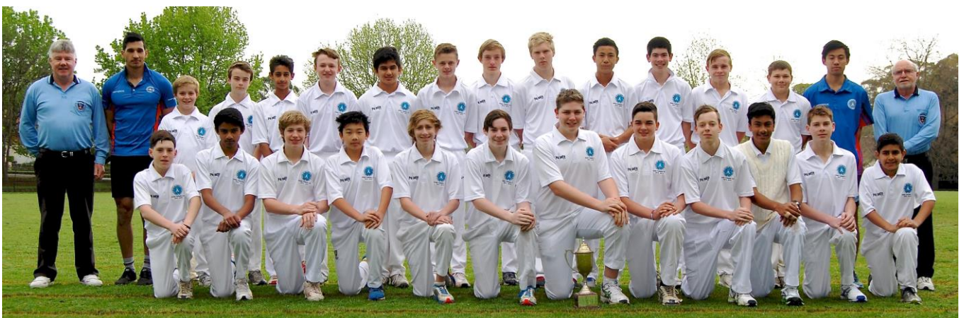
2014-15 match at Turramurra Oval