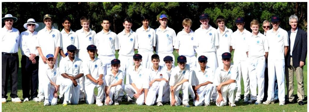
2010-11 match at Kenthurst Oval