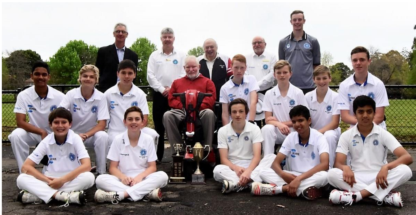
RTC West team – 2016/17