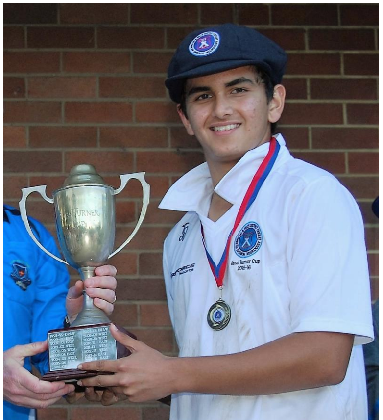
RTC winning Captain – 2015/16