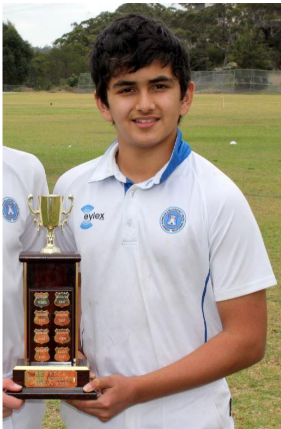
GHC Captain – 2013/14