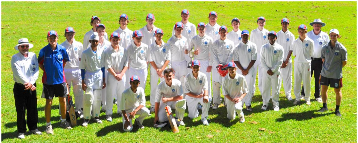
2012-13 match at Turramurra Oval