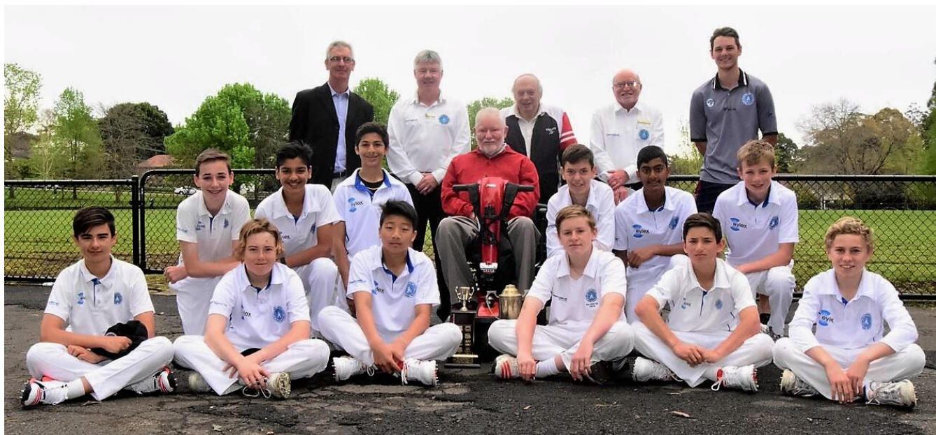
RTC East team – 2016/17