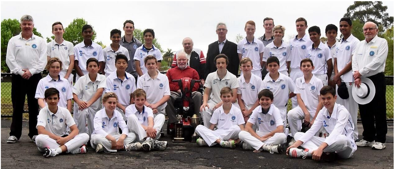
2016-17 match at Turramurra Oval