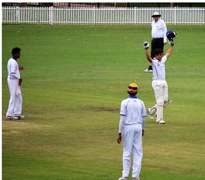
Dhruva's 151 v. Fairfield-Liverpool – 2015/16 (Record Weblin Shield aggregate – 380 runs @ 76)