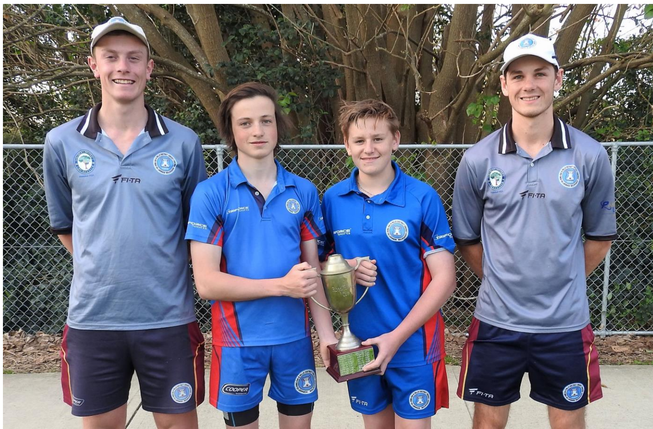
RTC Coaches and Captains – 2016/17