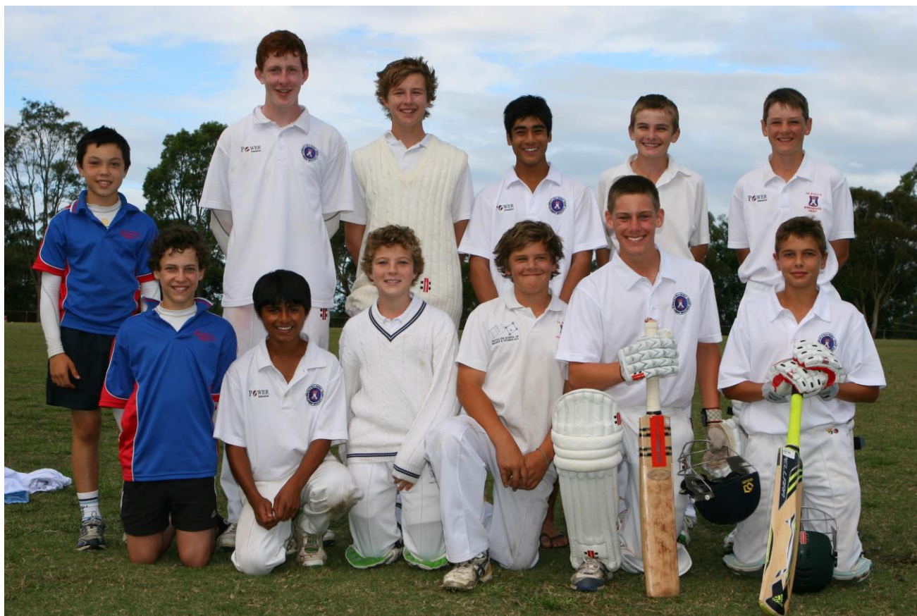
RTC East team – 2009/10