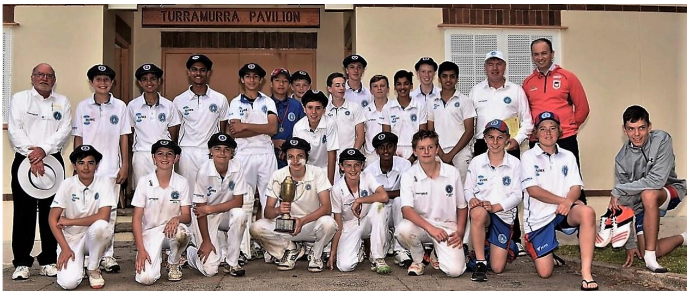
Matt Kean MP – Member for Hornsby, with the RTC players and umpires after the match