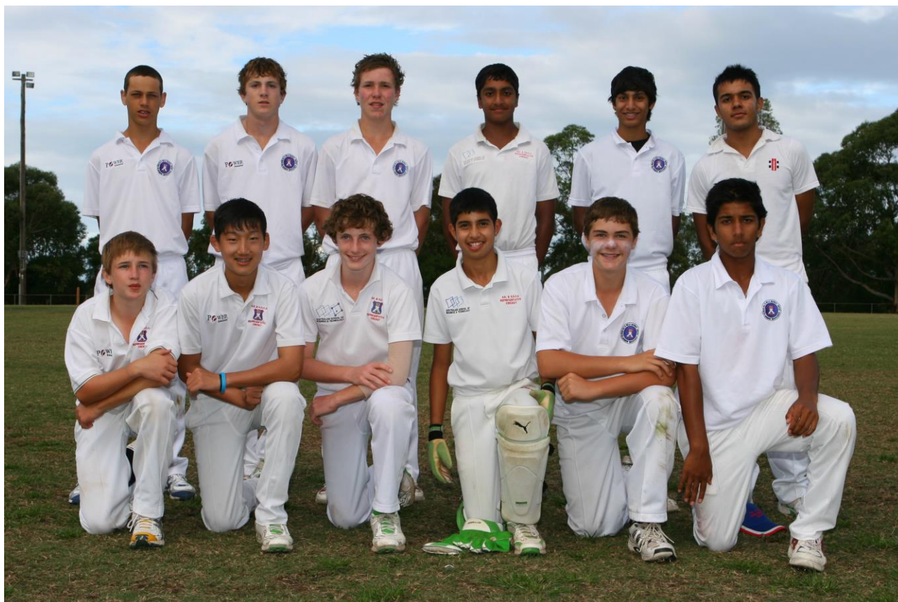
RTC West team – 2009/10