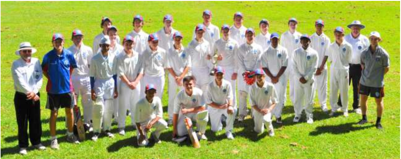
Below 2012-13 match at Turramurra Oval