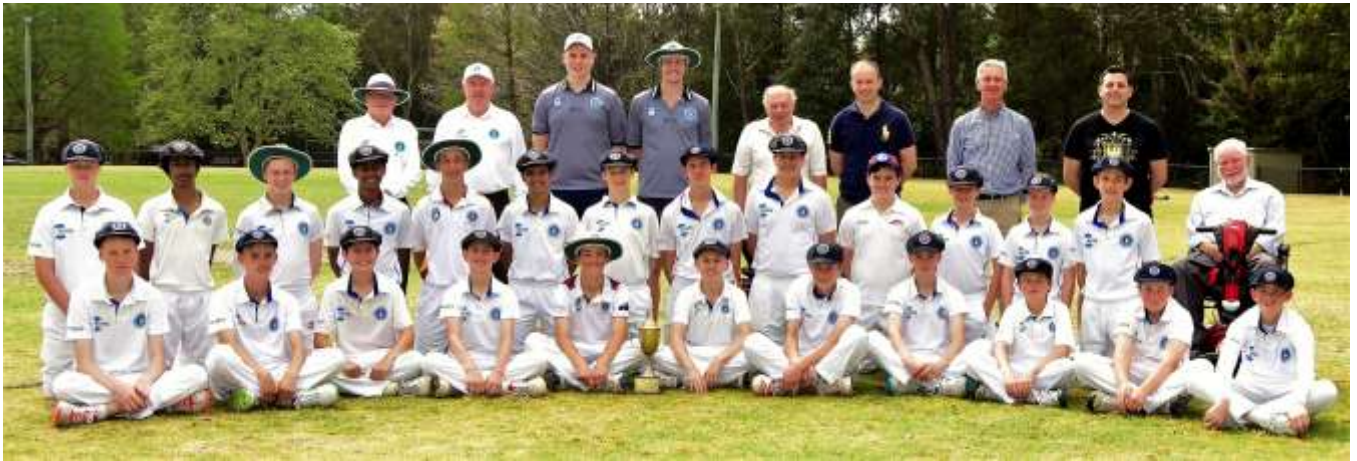
Above 2017-18 match at Turramurra Oval