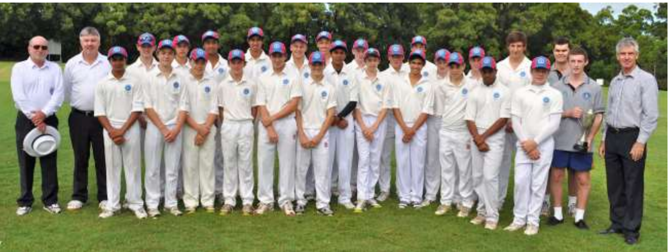
Above 2011-12 match at Kenthurst Oval