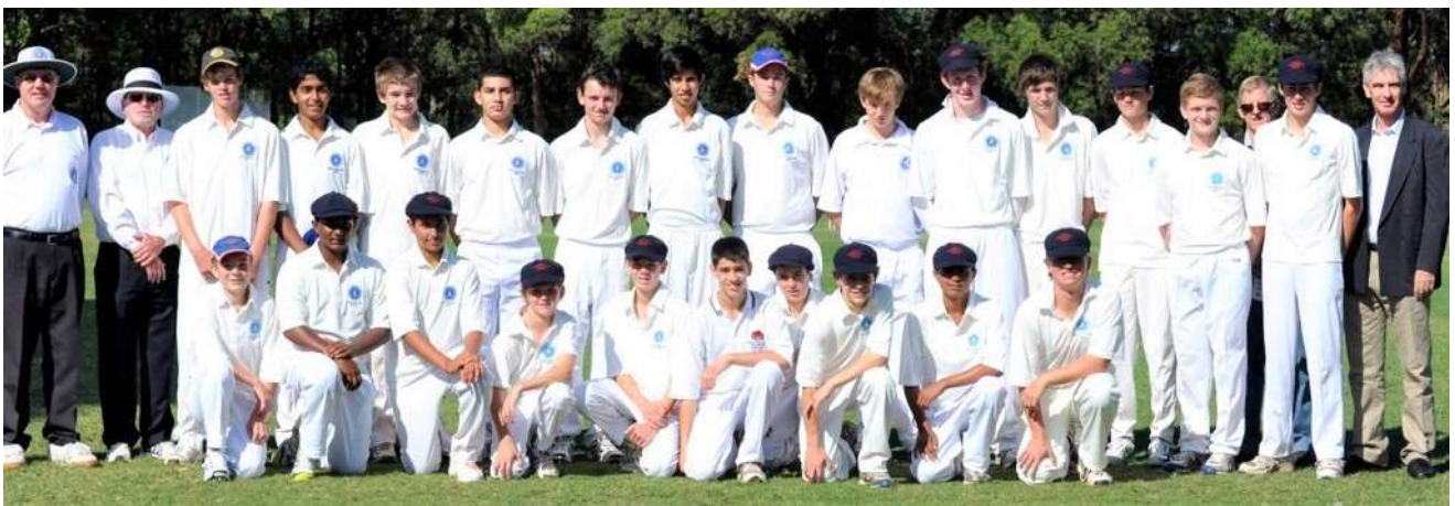
Below 2010-11 match at Kenthurst Oval