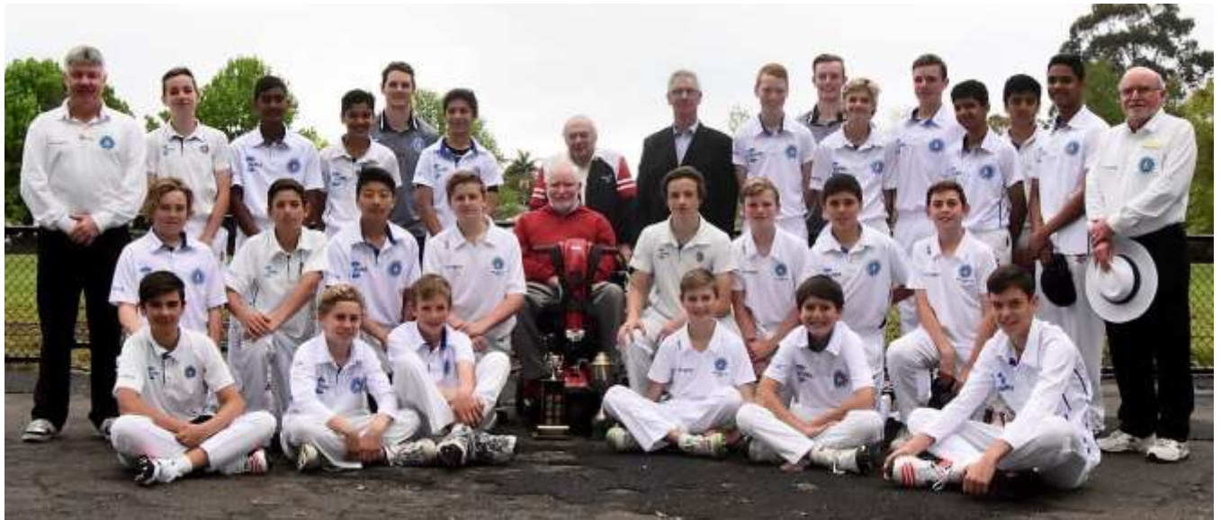
Below 2016-17 match at Turramurra Oval