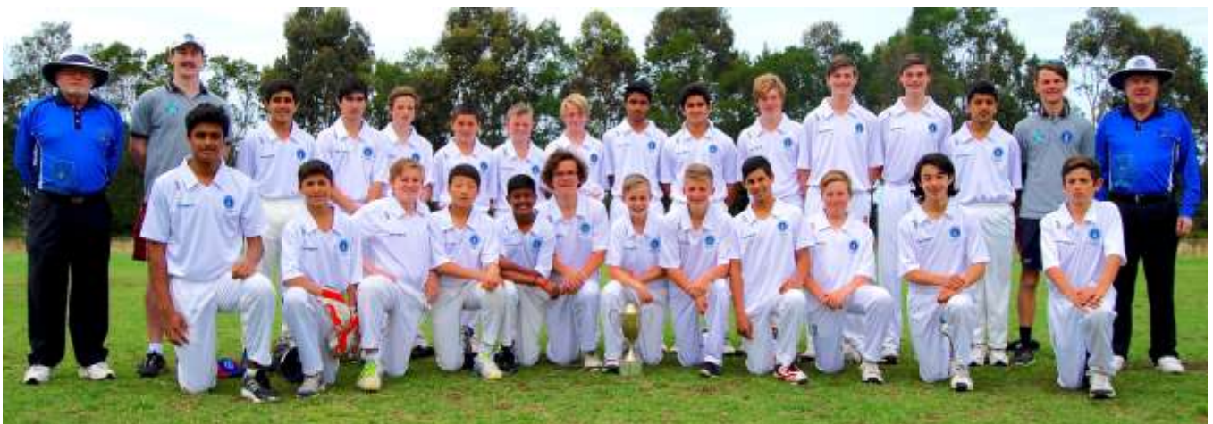
Above 2015-16 match at Headen Park