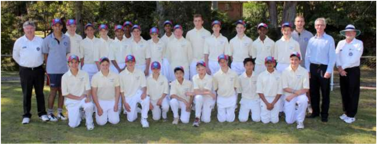
Above 2013-14 match at Turramurra Oval