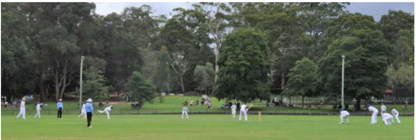
RTC action from the scenic Turramurra Oval – 23 February 2020