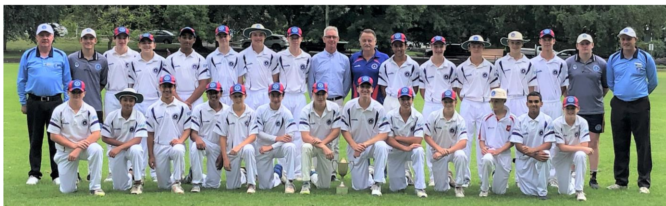
2019-20 match at Turramurra Oval