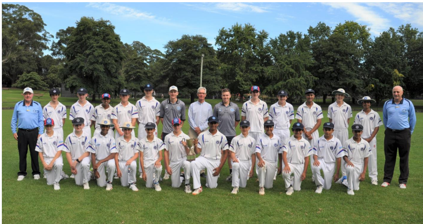
2020-21 match at Turramurra Oval

RTC East & West teams, coaches, umpires and special guests