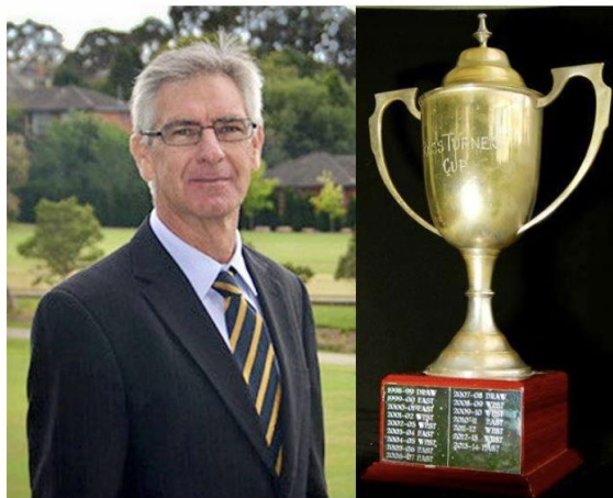
The Ross Turner Cup