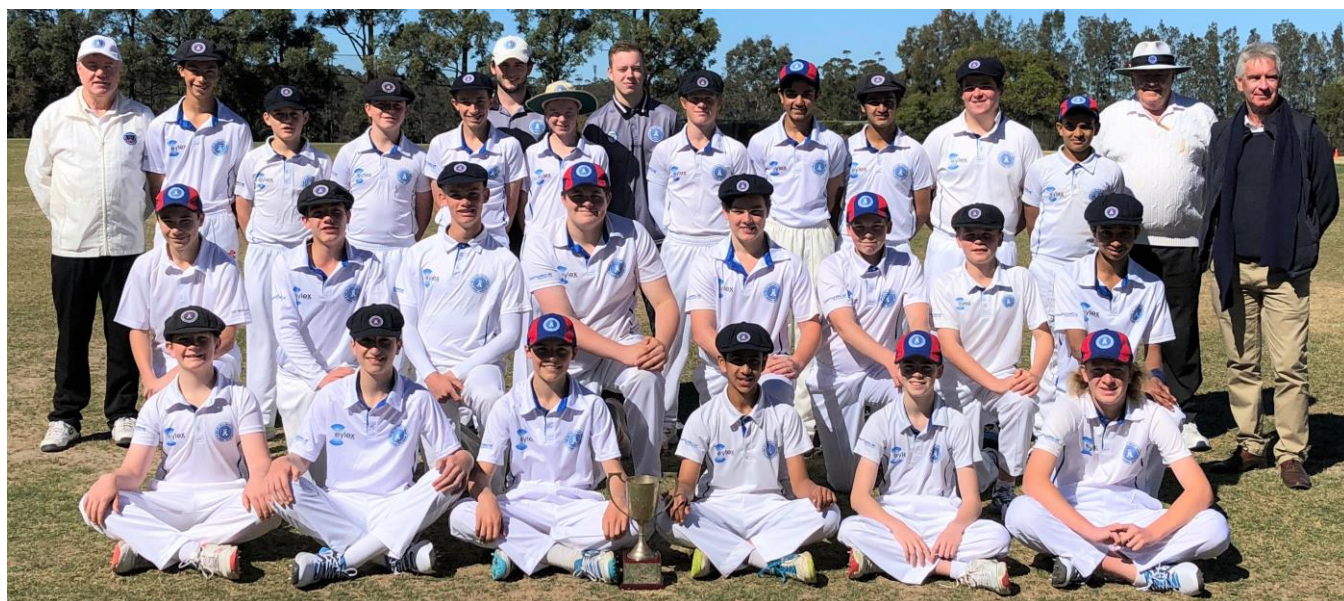
2018-19 match at Rosewood Oval, Barker College