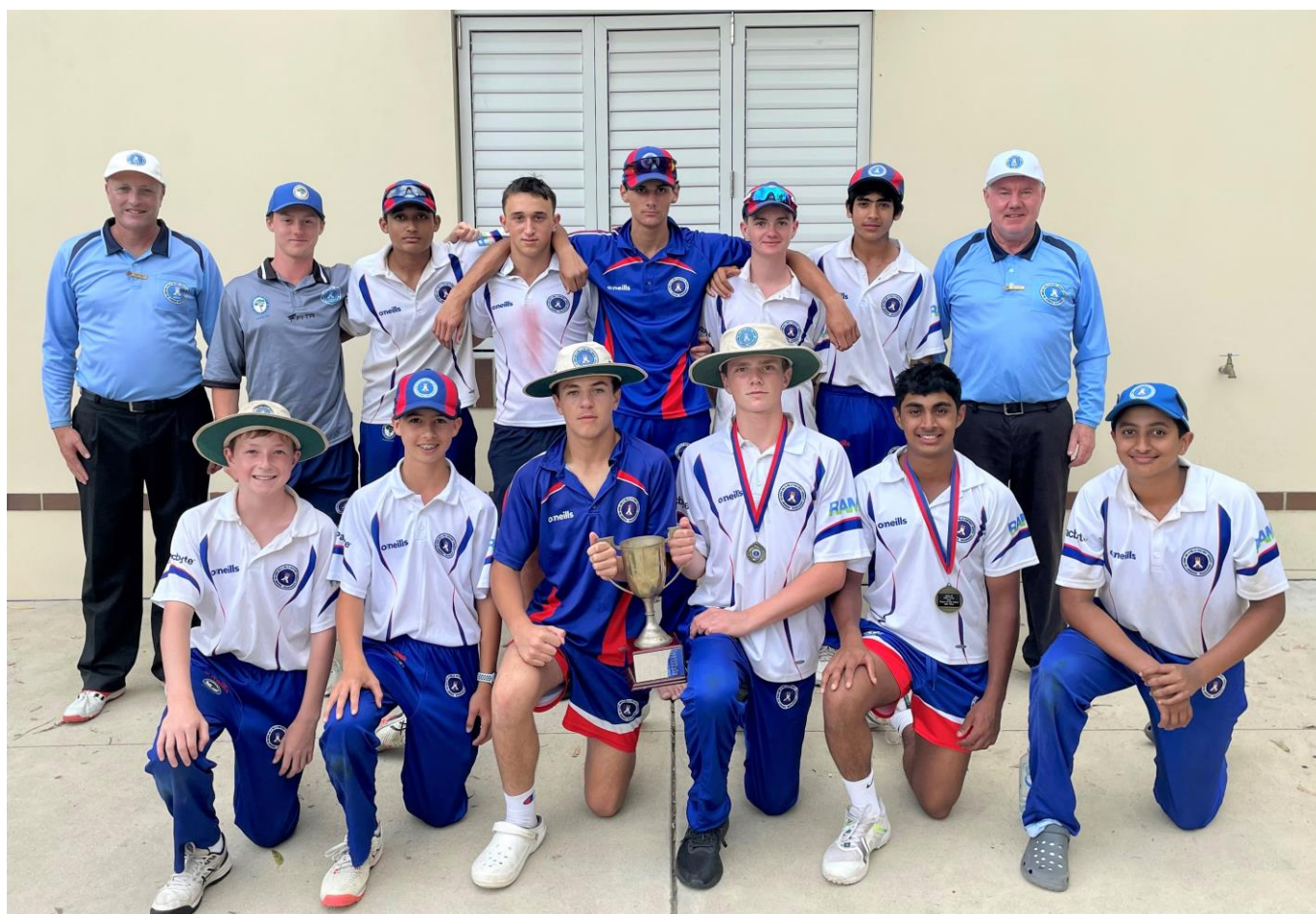
East team – winners of the RTC match in 2022-23