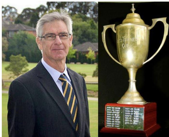
The Ross Turner Cup