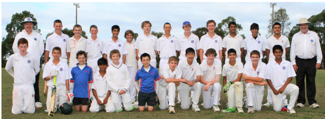
RTC 2009-10 – RTC East & West teams at Parklands Oval, Mount Colah