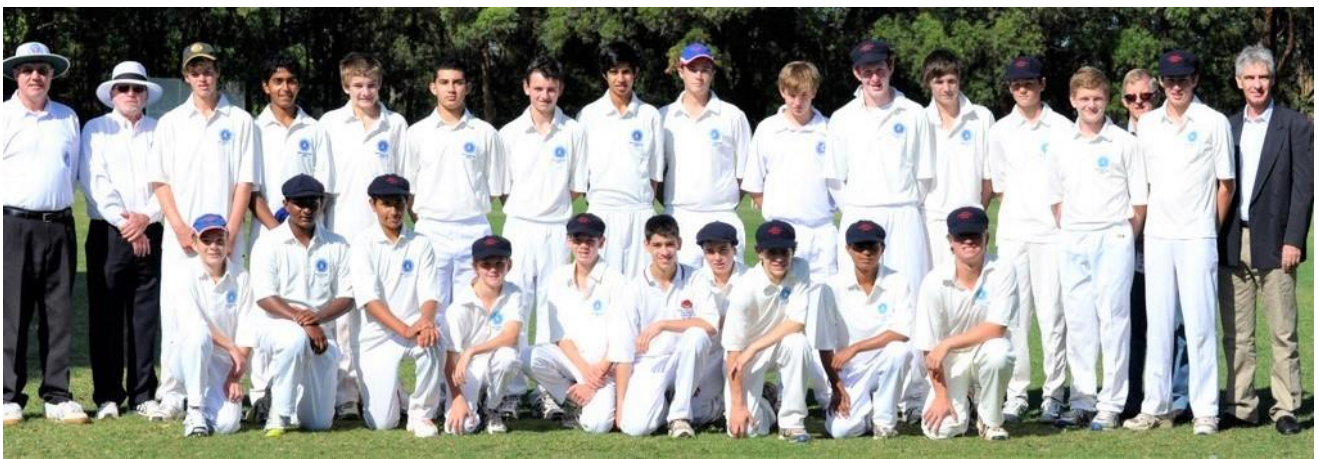
Below 2010-11 match at Kenthurst Oval