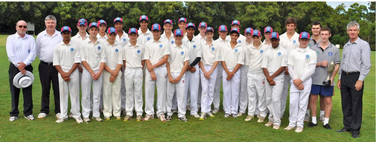
Above 2011-12 match at Kenthurst Oval