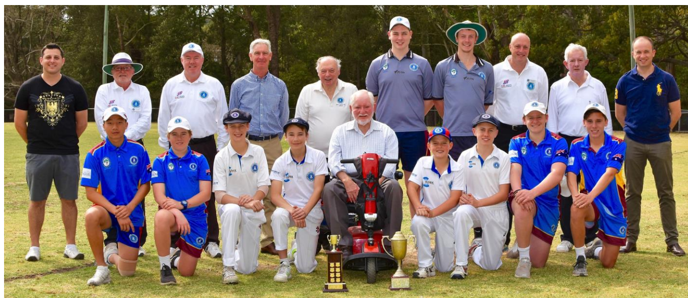
RTC and GHC Captains, Coaches, Umpires & Special Guests – 2017-18 (20 th Anniversary – RTC)

A life well lived and an innings of the highest quality