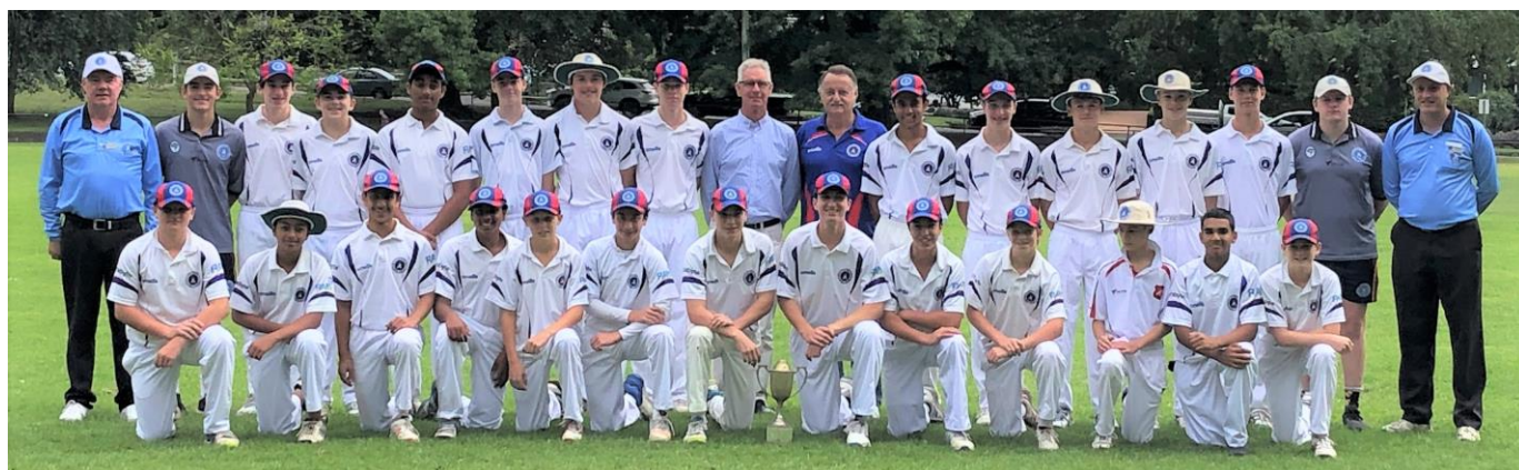
Above 2019-20 match at Turramurra Oval