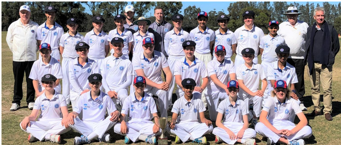
Below 2018-19 match at Rosewood Oval, Barker College