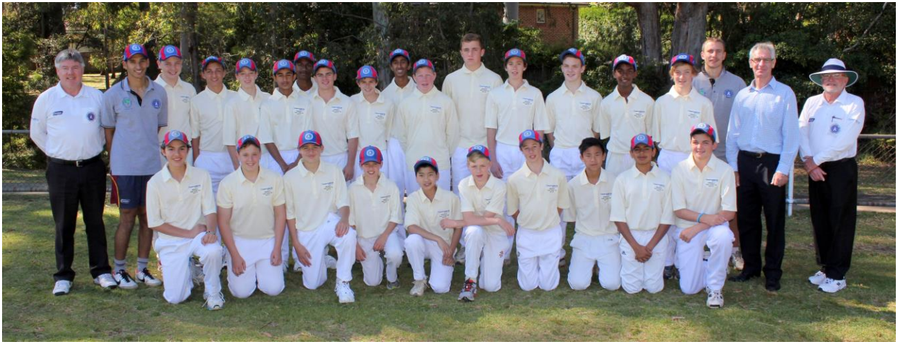
Above 2013-14 match at Turramurra Oval