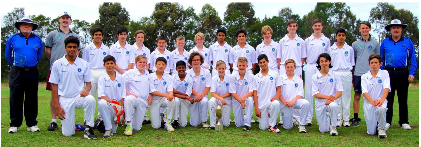
Above 2015-16 match at Headen Park