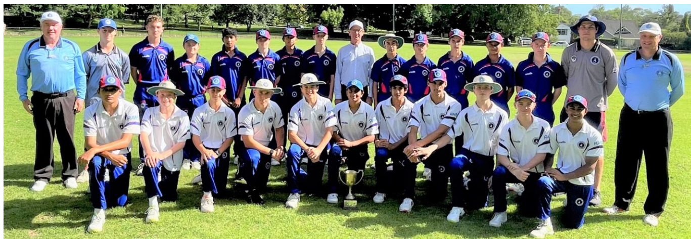
Above 2022-23 match at Turramurra Oval