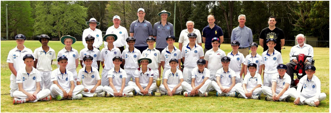
Above 2017-18 match at Turramurra Oval